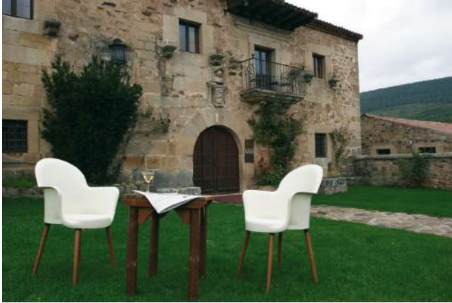
Posada Real de la Mesta, Molinos de Duero, Soria