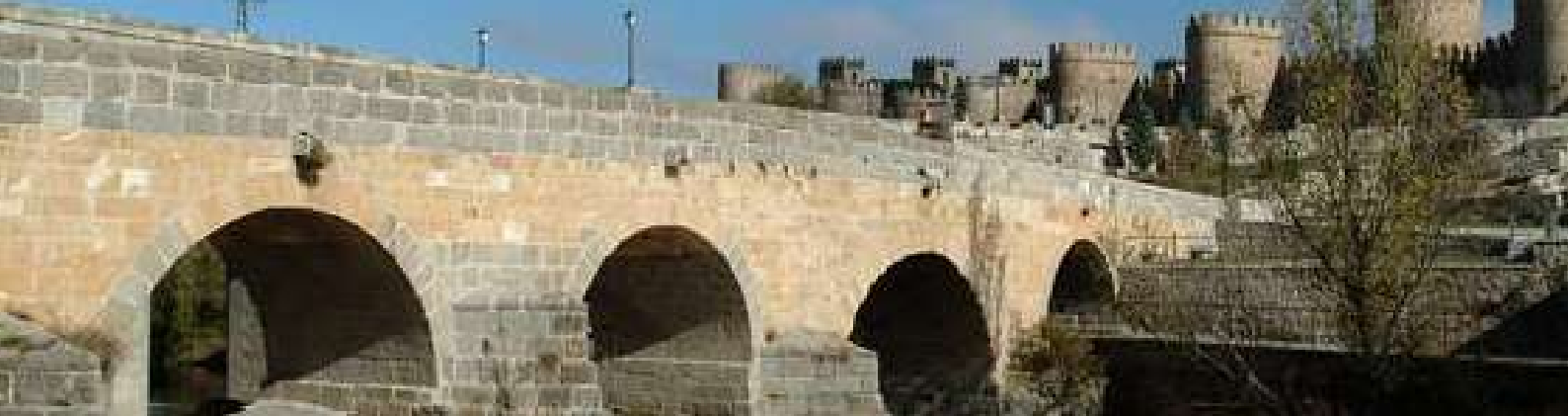
Puente Romano sobre el Río Adaja, Ávila