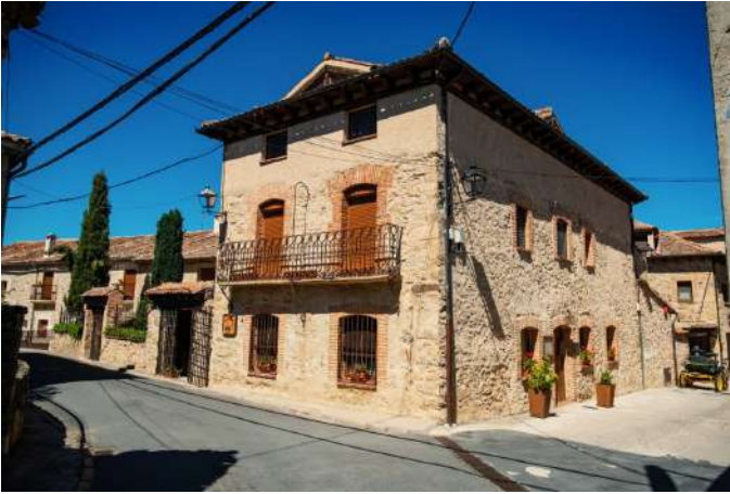
Posada Real Mingaseda, Navafria, Segovia