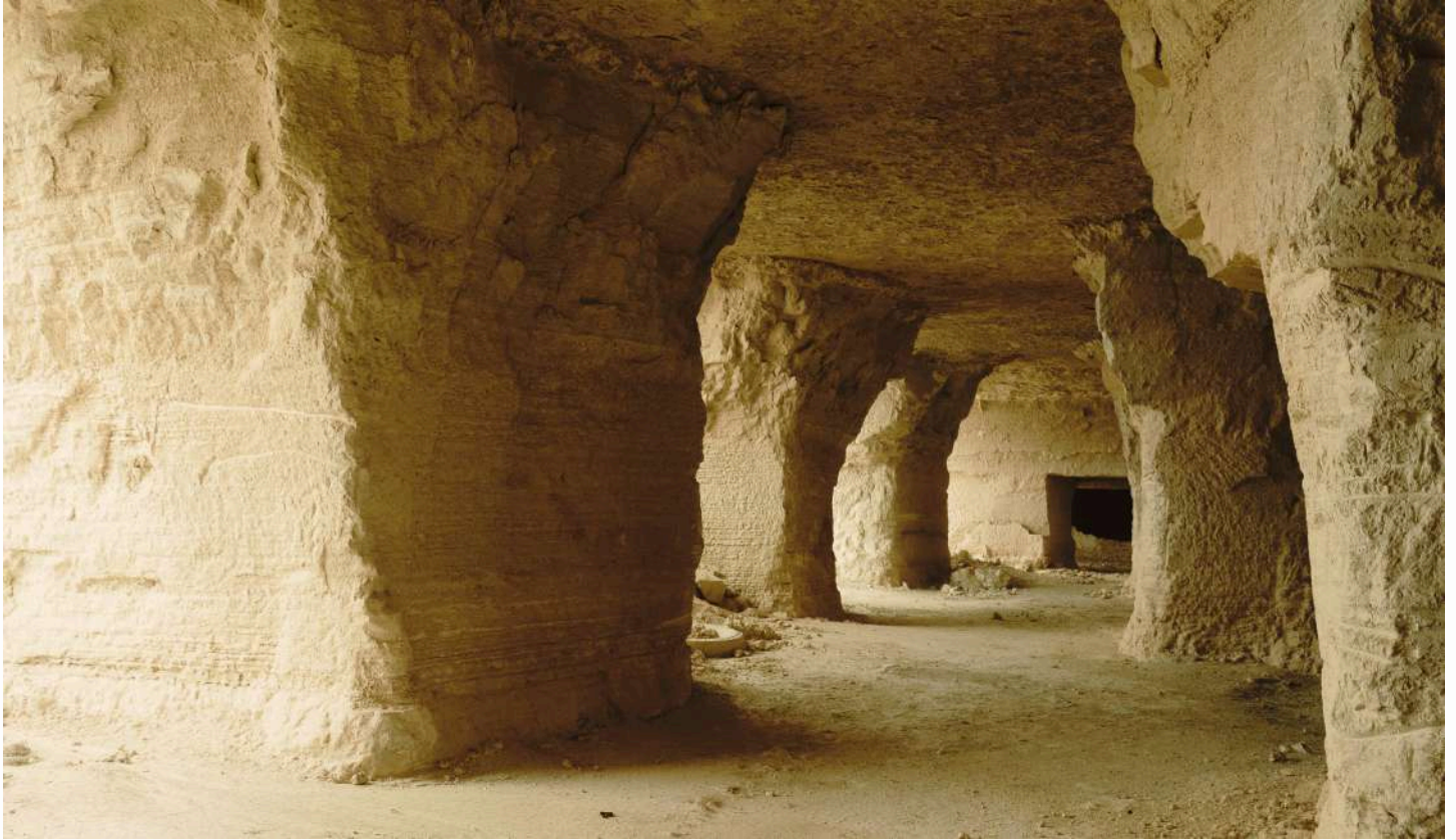
Minas de yeso de Hornillos de Cerrato, Palencia

The northern route spans the provinces of León, Palencia and Burgos, where visitors can explore the stunning landscape of Las Médulas, the largest open-pit gold mine of the Roman Empire, designated a UNESCO World Heritage site. Along this route, you'll find captivating museums, including those focused on energy, oil, iron and steel and mining, alongside several railway museums. Visitors can also explore underground mining galleries where light barely reaches—some are original, while others have been recreated for tourism. For cycling enthusiasts, the mountain bike trails winding through the mining valleys promise exciting discoveries, and the La Robla mining train provides a unique glimpse into fascinating locations.