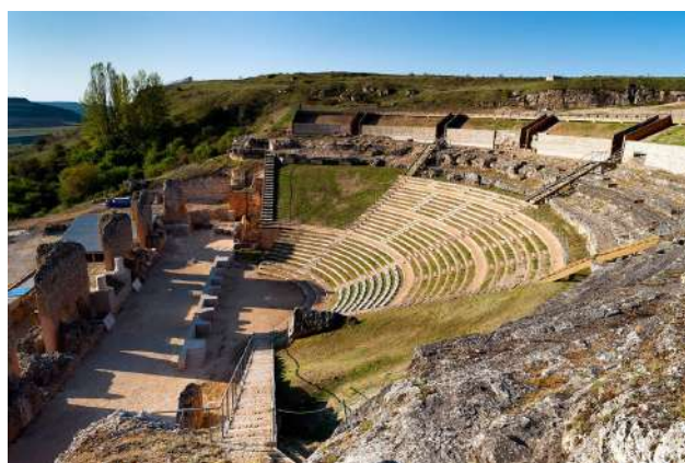
Anfiteatro de Clunia, Burgos

The Festival, which will take place on the 11th, 12th, 13th, 18th and 19th of August, will be held in the unique setting of the Roman Theatre of Clunia, located in the town of Peñalba de Castro. The Roman city of Clunia Sulpicia was one of the largest and most significant cities in Roman Hispania. Before the Romans, Clunia was a settlement of the Arévacos, as well as a site of the Cantabrians and Vascones. Tiberius founded a Roman municipium there and later, in the time of the emperors Galba or Hadrian, it obtained the rank of colony, Colonia Clunia Sulpicia. The city grew to more than 30000 inhabitants. Highlights include its remarkable theatre, which was excavated out of the rock itself, boasting a capacity for 9000 spectators; the thermal complex of "Los Arcos" and the forum, a public square that worked as a religious, administrative and commercial centre. There stood the temple dedicated to Jupiter and the courts of justice, as well as the magnificent collection of mosaics discovered in many of its stately homes.