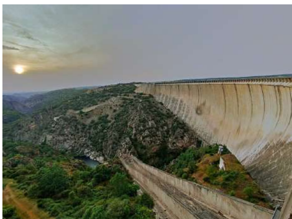
Presa de La Almendra, Zamora

The Douro River and its tributaries have carved out a surprising succession of canyons on the natural border with Portugal, over which spectacular dams and hydroelectric falls have been built. The Almendra dam collects the waters of the Tormes, just before it joins the Duero river. As big as an inland sea, it has a capacity of more than 2,600 hm 3 and holds the record for the highest dam, 200 metres from the bottom of the reservoir to the top of the dam. A fascinating tunnel, excavated in the rock, 7 metres wide and 15 kilometres long, carries the water from the dam to the underground power station at Villarino de los Aires, a complex engineering work that allows the turbines to be reversed and the water to be returned to the main reservoir. These colossal dams are chosen by advertisers as ideal locations to film impressive advertisements, also by filmmakers looking for shots worthy of unforgettable scenes. The protagonists of films such as "Doctor Zhivago", "The Cabin" and "Terminator" are familiar with these locations, having filmed important scenes on these concrete screens. Moreover, car companies use these monuments of civil engineering to advertise their most sophisticated vehicles.