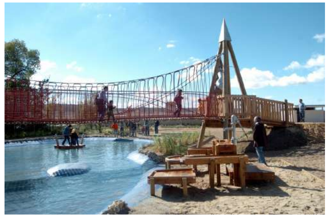
Valle de los 6 sentidos, Valladolid

Valladolid has many places for children to enjoy themselves, from museums where they can interact and learn at the same time, such as the Science Museum and the Casa de Colón, to guided tours for children. However, if there is one place that is sure to amaze the little ones, it is the Campo Grande. Located in the centre of the city, the Campo Grande, as the name implies, is large and boasts a variety of vegetation, but what really catches the eye are the animals that inhabit it, such as peacocks, swans, and squirrels. The Valley of the 6 Senses (Renedo de Esgueva) is not to be missed either. This children's playground has the clear aim of being the most ambitious and complete in Europe. This is due to the number and diversity of the features planned (60 games) and the large number of users, as it allows up to 400 children to play at the same time. The Enchanted Castle (Trigueros del Valle), with its hidden passages, will take you to dungeons inhabited by dragons and a labyrinth where all kind of experiments are carried out. The Mudéjar Theme Park (Olmedo) features scale reproductions of the most characteristic buildings of Castilla y León.