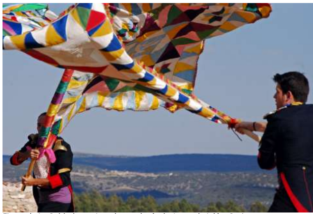
Fiesta de La Soldadesca, Iruecha, pedanía de Arcos de Jalón, Soria