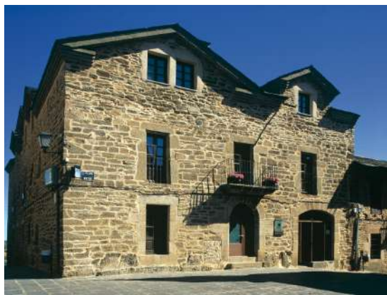
Posada de las Misas, Puebla de Sanabria, Zamora