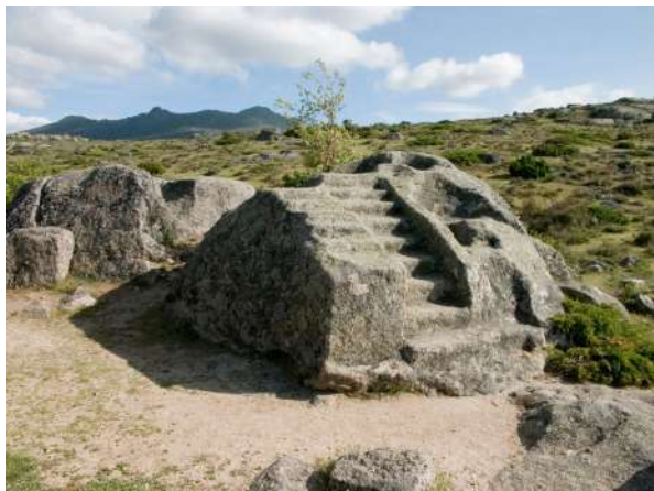
Castro de Ulaca, Solosancho, Ávila