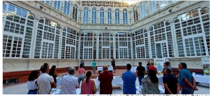
Cata maridaje en Palacio Provincial Diputación Palencia

Would you like to enjoy a guided tour of the Provincial Palace of the Diputación de Palencia (Provincial Council of Palencia) followed by a wine tasting in the courtyard of this beautiful modernist building? Then don't miss the opportunity to book your spot. The #SaborearLoAuténtico (#SavourTheAuthentic) campaign invites us to explore the Cerrato Palentino region, as a wine tourism destination that promotes and makes known the wines that are produced in Palencia's wineries, protected by the D.O. Arlanza and Cigales. They are paired with the quality brand Alimentos de Palencia, thus offering a tour of the resources and tourist products that the Cerrato Palentino treasures, highlighting the underground cellars of Baltanás and Torquemada, declared of Cultural Interest in the category Areas of Ethnological interest, together with other historical sites such as Dueñas, Astudillo or Palenzuela, and particular monuments such as the Basilica of San Juan de Baños, as well as the different leisure activities offered by the natural surroundings of Cerrato, such as rafting.