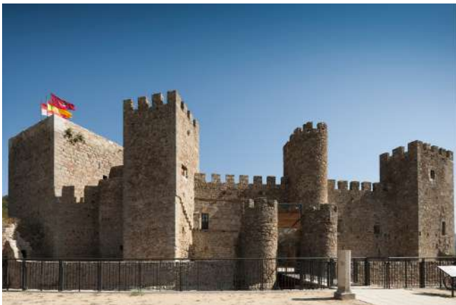
Castillo Montemayor del Río, Salamanca