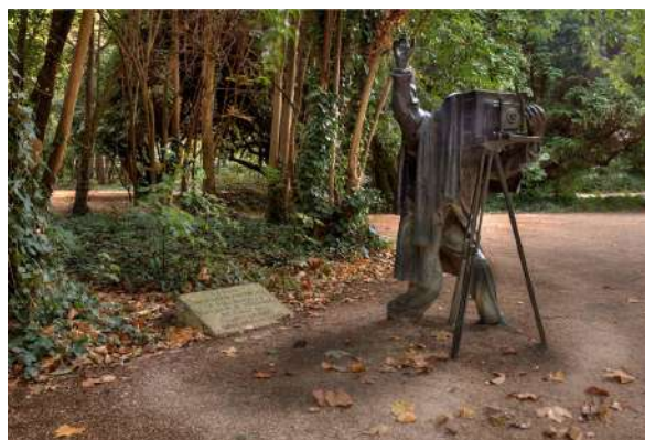
Campo Grande, Valladolid