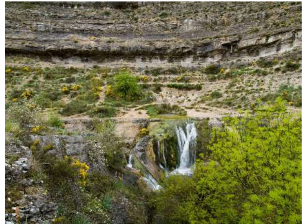
Cascada de Fuenteodra, Burgos

When it rains heavily, especially in the winter and spring, a wide variety of waterfalls can easily be enjoyed. These make for the biggest tourist attraction in the hamlet of Fuenteodra, nestled in the Las Loras Geopark. As this is a limestone area, the water filters through the rock looking for cracks to flow out through as a “stream”, waterfall, or spring. On this short 1,500 metre trail following sheep paths that trace the hill westwards up to 4 waterfalls are to be found, each more interesting than the last: the Odra waterfall, the Manapita spring, and Los Aceites and Corral pools. The most famous and impressive of all, as it boasts the most water, is the Yeguamea waterfall.