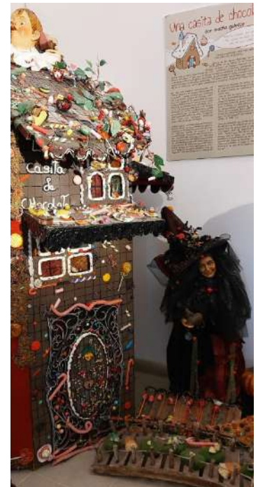
Museo de los Cuentos y la Ciencia, Paredes de Nava, Palencia