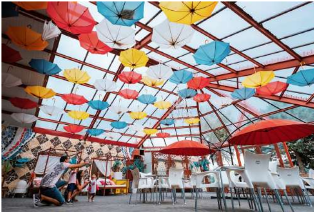
Posada Real El Indiano, Cidones, Soria