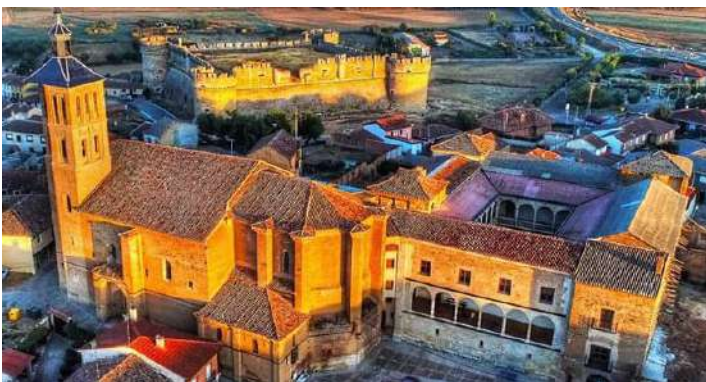
Grajal de Campos, León