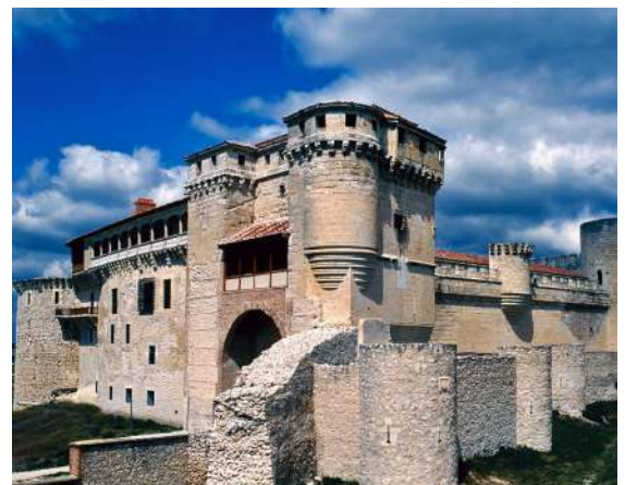
Castillo de Cuellar, Segovia

Capital of a large region of Towns and Lands, this town is located in the northeast of Segovia province, practically an equal distance from both the provincial capital and Valladolid. Situated in "Tierra de Pinares", this town saw the three cultures of the Iberian Peninsula, "Jews, Muslims, and Christians", live alongside one another, as we can see in its Jewish Quarter, Morería (Moorish Quarter) street, the Muslim Santa Clara necropolis, and its churches. Cuéllar is an important centre of Mudéjar architecture with churches such as the Churches of San Andrés, San Pedro, San Esteban, and San Martín. Moreover, the town walls are one of the most important in Castille and Leon. Some thirteen hundred metres of the original two thousand metres are preserved. It also has tanneries, palaces, mansions, and the Castle of Alburquerque. This was first recorded in 1306 and it has an internal courtyard with a double gallery of 16th century segmented arches, halls with decorated ceilings, crafted from stucco and carved beams. An interesting detail is that the first recorded windmill in Castille and Leon, dated to around 1496, is found at the back of the "La Heurta del Duque" park. The celebrations for Our Lady of the Rosario and the bull runnings are of particular note, and have been declared International Tourist Attractions.