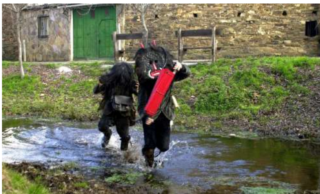
Los Carochos de Riofrío de Aliste, Zamora