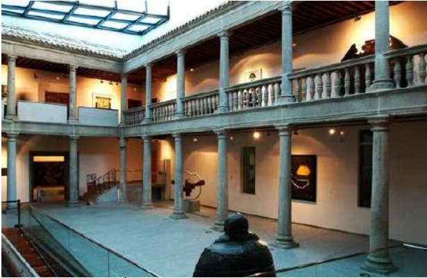
Palacio de los Serrano, Ávila