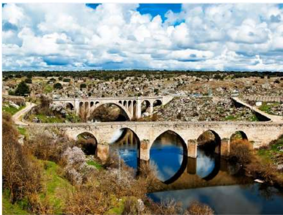
Puentes de Ledesma, Salamanca