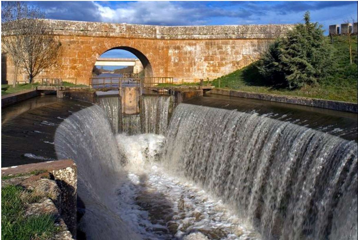
Esclusa del Canal de Castilla, Ribas de Campos, Palencia