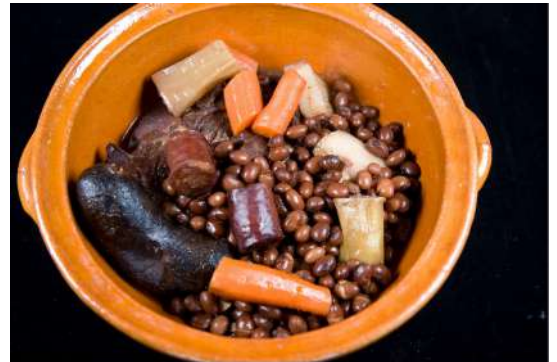
Alubias rojas de Ibeas de Juarros, Burgos

This is the star stew dish in Burgos cuisine, ideal for these winter months when the cold sets in in our region. It takes its name from the traditional dish it's cooked in and the fact that it is a hearty dish that is suitable for the winter, as it roughly translates as "powerful pot". Various theories account for its odd name, although it is usually accepted that it comes from olla poderida (pot of the powerful) in allusion to the fact that only the wealthy were able to afford such a rich dish or the "powerful" ingredients that make it up, which give those who eat it energy and strength. This is a very old dish. Indeed, writers from the Spanish Golden Age such as Cervantes and Calderón de la Barca mention it. The main ingredients are Ibeas kidney beans, accompanied by strong meat produce such as a variety of morcilla blood sausage made with rice, chorizo, pork ribs, bacon, pig ear and snout or trotters. The Kidney Bean Festival is held in Ibeas de Juarros in November.