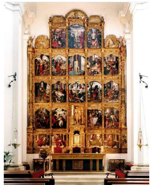
Retablo Iglesia de Carbonero el Mayor, Segovia