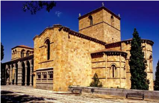
Basilica de San Vicente, Ávila

One of the most emblematic monuments in Ávila, which is a must-see for anyone visiting our beautiful town, is the Basilica of San Vicente. Located beyond the city walls and built in caleño granite, it was constructed in honour of the martyr saints Vicente, Sabina, and Cristeta on the site where tradition states they were martyred and buried. It held the status of iglesia juradera (a church where court cases could be held) and stands as one of the finest examples of Romanesque and Gothic architecture and sculpture. It boasts a magnificent semi-circular arch portico, monumental Gothic portal entrance, the chapels with prominent capitals telling the story of the chancel, the southern cornice, and the eastern and southern façades. Inside, the arrest, sentencing, and martyrdom of the saints is depicted on the impressive cenotaph. The central chapel, in the presbytery, houses the image of the Virgen de la Soterraña, the patron saint of Ávila.