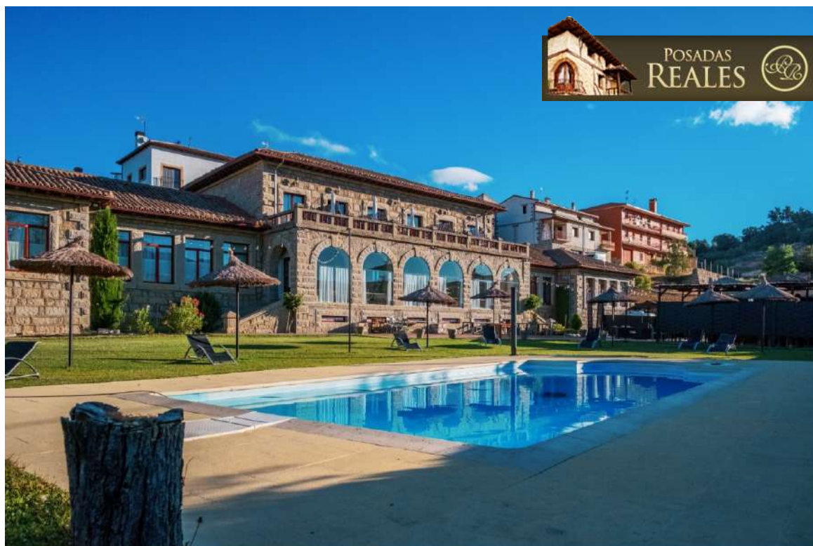
Posada Rural Linar del Zaire, Burgohondo, Avila