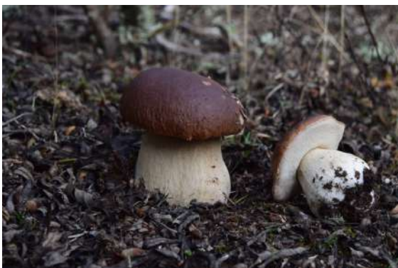
Micología zamorana

Zamora conjures up flavour, beauty, quality, welcoming people, and unique sensations. In the sensations inspired by the hills we have mushroom picking, family days out hunting for mushrooms and good food. With over 500 documented species, the province of Zamora is home to one of the biggest mushroom industries in Spain. Every year, especially in autumn and spring, mushroom associations, institutions, and the hospitality sector offer visitors different options for unique mushroom-based experiences. Visitors can purchase two-day leisure permits for €10 that will allow them to visit mushroom areas participating in the project to collect up to 3kg of mushrooms a day. Explore the excellent range of mushroom restaurants or if you want to learn about less well-known species from experts, you can hire accredited mushroom guides. Mushroom events, the mushroom museum in Rabanales, trips to the countryside, and weekends of mushroom cuisine, with delicious set meals at highly recommended prices, are just some of the many options on offer from the regulated area in the province of Zamora.