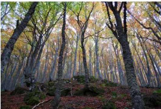
Hayedo de Cofiñal, León

There are many beech woods in the Central Leon Mountains which dazzle with their wide range of colours in autumn. The most well-known is unquestionably the Faedo de Ciñera de Gordón, an easy stroll that takes just two kilometres to reach and stretches a total of six. It is home to a centuries-old beech known as "Fagus" which makes this a magical forest. In the valleys of Gordón we can also visit the beech woods of La Boyariza, nestled between the villages of Geras and Carbonera, an impressive, well-signposted trail that runs along a stretch of the left bank of the River Casares. Towards Vegacervera, in the town of Matallana de Torío, the Orzonaga beech wood offers an easy path with wonderful specimens all along the trail. Very close by, in Vegacervera, next to the famous cave which presents us with a dreamlike vision of the karst landscape, is the start of an easy and mostly flat trail that leads to another beech wood. Continuing on north, in the town of Cármenes, we come to a beech wood that starts in the village of Canseco and sprawls towards Pontedo in an approximately eight kilometre-long path in the River Torío basin. Lastly, in Llamazares, close to the Coribos caves, we reach the final beech wood, Bodón, where the colours of the forest and the mountains make for spectacular views of the landscape.