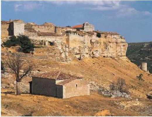
Castillo de Rello, Soria