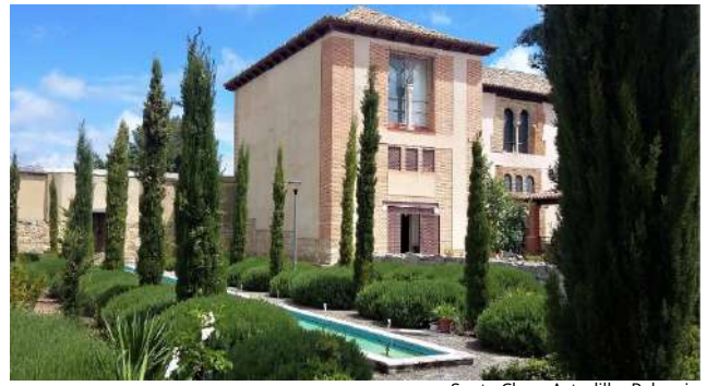
Santa Clara, Astudillo, Palencia

The Santa Clara convent was built in the 14th-15th century. It was founded by María de Padilla. This is one of the most impressive sites of Mudejar art in the province of Palencia which includes the main facade and carved plaster reliefs in the same style decorating a large part of the monastery. It was declared a National Monument in 1931 and a Site of Cultural Interest in 2005. The convent is home to cloistered nuns but a large number of the rooms can be visited such as the magnificent Gothic-Mudejar church, the choir-mausoleum, the tower, the courtyard and water pool, and the beautiful and extensive museum (which also has a stunning collection of almost 2,000 nativity scenes from all over the world) enclosed by ornate wood-panelled ceilings in what was once part of the old Palace of Pedro I (the Cruel for some and the Just for others). A wonderful visit that should be rounded off by picking up the tasty pastries that the nuns make by hand which a true "heavenly delight". Winter opening hours: Tuesday to Sunday: 11:00-13:00 and 16:30-18:30 (please confirm at Christmas time). Masses: Sunday and festive days: 09:00, daily: 08:30. General entrance fee €4, discounted €2, free on Fridays Tel: (+34) 979 822 134.