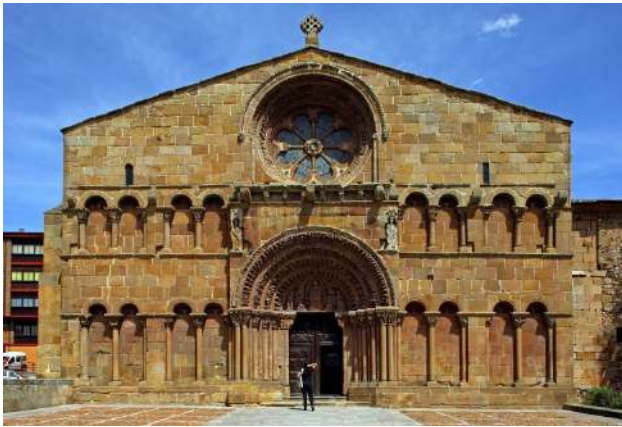
Iglesia de Santo Domingo, Soria

In the 35 neighbourhoods and parish churches that gave rise to the city of Soria, there are many fine examples of this medieval art that have been preserved. In the River Duero area, you can find one of the most original examples of Spanish Romanesque art: the cloister and church of what was the old San Juan de Duero monastery. A little bit further away, on the promenade to the San Saturio hermitage, stands the San Polo monastery. Climbing towards the city centre you come to the magnificent cloister of the Co-cathedral of San Pedro, as well as the remains of what was the church of San Nicolás and is now a cultural centre. The churches of Santo Domingo and San Juan de Rabanera, with their door and apse respectively, are also highly important works of Spanish Romanesque art that can be found on a journey through the old town.