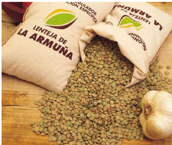
Lenteja de la Armuña, Salamanca