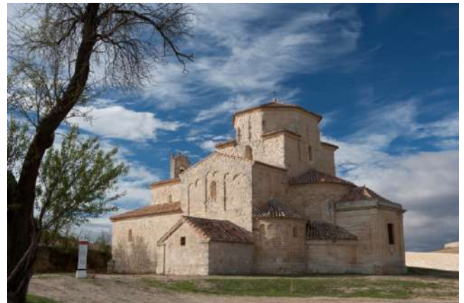
Iglesia de Urueña, Valladolid

This medieval village in the province of Valladolid, was granted in 2007 the distinction of book town as the village with the most bookshops in the whole of Spain, with a grand total of 12. It has been a member of the most beautiful villages in Spain association since 2013. This is largely due to its charm as it is almost fully enclosed by a 13th century wall, a castle on the walls, and has cobbled streets. The village has two entrances: the Puerta de la Villa and Puerta del Azogue gates. You can also walk along the ramparts with a view of the beautiful village on the one side and the vast plains of Castile on the other side. It was declared an Historic-Artistic Site in 1975. Also not to be missed are its five museums of art and culture. To round off your visit, head to the outskirts to see the Anunciada Hermitage, the only Lombard Romanesque church in Castile and Leon. The celebrations for its patron saint are held on 25 March and the romeria procession is on 8 September.