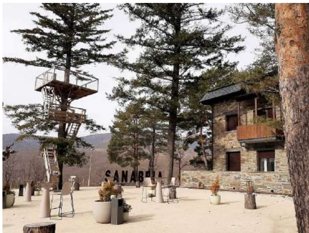
Posada Real Villa Lucerna Sports&Hotel Resorts, Galende, Zamora