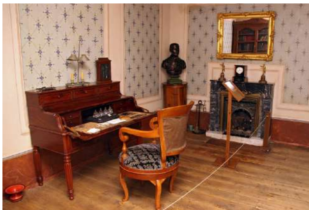
Casa Museo Sierra-Pambley, León

The Sierra Pambley House Museum is located on Plaza de Regla, opposite the Cathedral of Leon. It is a 19th century old mansion of a wealthy intellectual from the time. This is one of the finest examples of middle class houses that includes all the innovations of the day. Visitors can explore all the rooms in the house, which have been kept just as they were, as well as learn about the strange story of the family, including the first owner of the house who devoted all his efforts to wooing his niece, who he did not succeed in marrying in the end. Another house museum in the city of Leon is the Perez Mansion, which is nowadays the Museum of Leonese Emigration. The manor house was built by Manuel de Cárdena in 1925 as a family home for the famous carpenter Miguel Pérez Vázquez. The mansion has carved friezes in the shape of the San Marcos choir stalls, as well as other styles such as its art deco decoration and Japanese-inspired painted wallpaper.