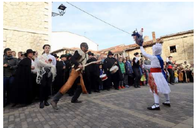
Corrida del Gallo de Carnaval, Mecerreyes, Burgos

Carnival Sunday in Mecerreyes is the setting for the Rooster Run, definitely one of the most unique carnival celebrations in the province of Burgos, which has been declared a Regional Tourist Attraction. The whole village takes part in the celebrations, singing, dancing, and chasing the Rooster. Although there are prominent figures, dressed in strange costumes, who have a more important role. El Gallo (The Rooster): the figure the whole celebration revolves around. A cloth rooster has been used in recent years. El Rey (The King): a child aged around 10, who carries the rooster and stands in the middle of the street so the youths can try to snatch the rooster. Zarramaco: young man dressed in leathers and cowbells, whose job is to defend the rooster from the youths. Danzantes: youngsters who flank the King, they dance to the sound of dulzainas and small drums. Sheriffs and Chief youth: they have the task of making sure the rules are followed, keeping the lines, and so on. The village also has an interesting museum on the Carnival.