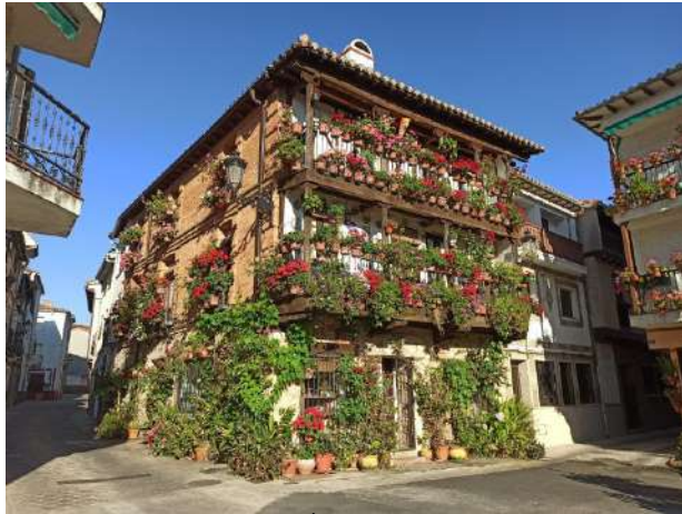
Museo Juguete Hojalata, Candeleda, Ávila