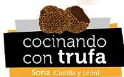
Trufa de Soria