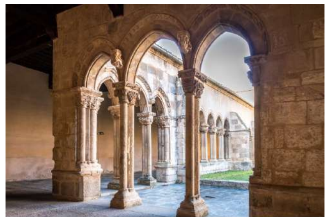
Claustro Santa María la Real de Nieva, Segovia