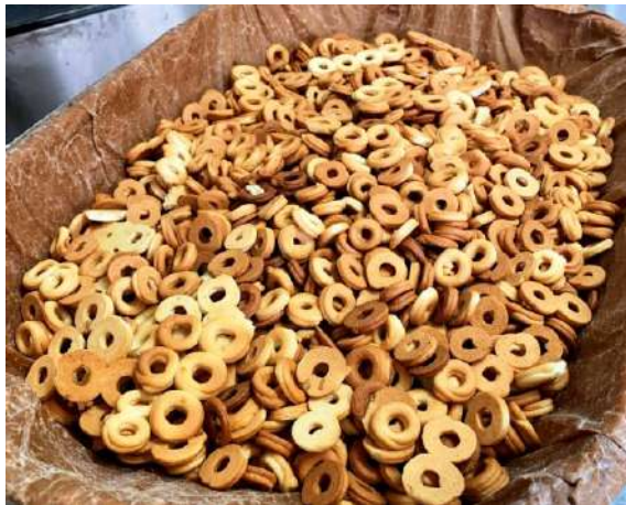
Rosquillas de Ledesma, Salamanca