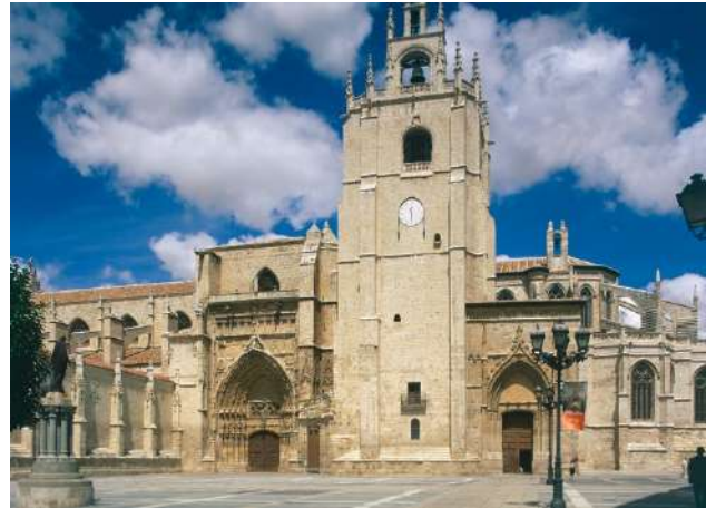
Catedral de Palencia