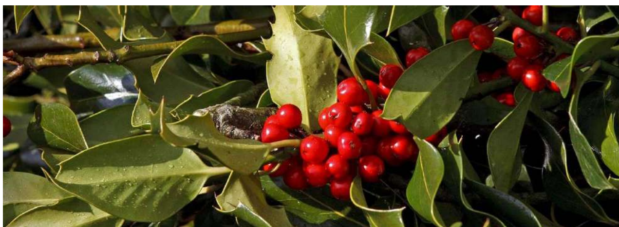
Acebal de Garagüeta, Soria