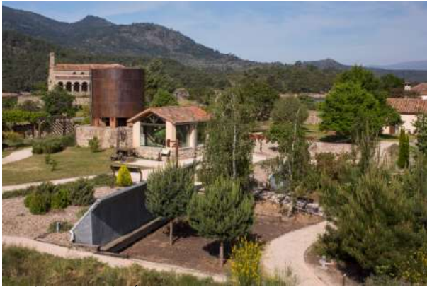
Casa del parque Iruelas, Ávila