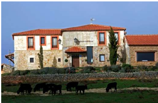
Posada Real Faenas Camperas, Cabeza de Diego Gómez, Salamanca