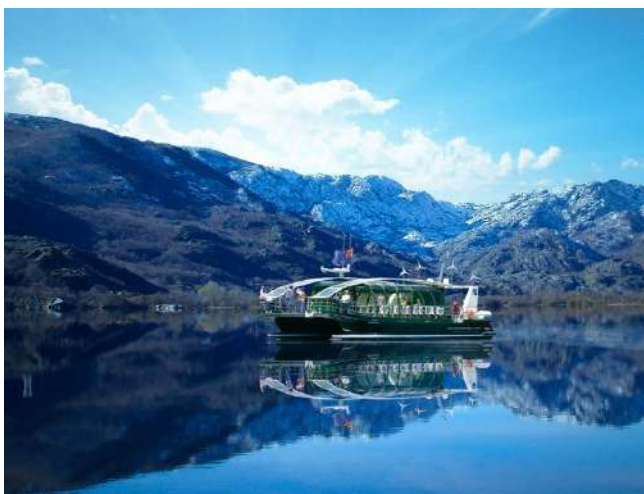
Lago Sanabria, Zamora

Remember, in Castilla y León, you'll find everything and more... WE CAN'T WAIT TO SEE YOU!!!