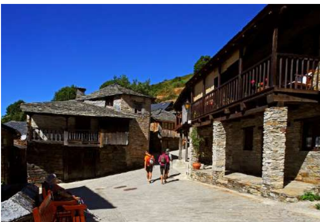
Peñalba de Santiago, León

Bierzo's Wine Route is one of the eight Wine Routes found in Castilla y León. It stretches across the west of the province of León, along the Camino de Santiago, bordering Galicia and Asturias. There are nineteen affiliated wineries, all with a strong family tradition, which have been able to pass on this age-old tradition from generation to generation, offering unique experiences for wine lovers. Among its varieties of grapes are mencía, garnacha tintorera and godello. The region is also surprising for its numerous natural and heritage landmarks. There are a variety of hiking and cycling routes which will take you through such beautiful towns as Molinaseca, Villafranca del Bierzo, Ponferrada and Peñalba de Santiago. The star product of the area's gastronomy is the botillo (a type of pork sausage) and quality brands such as the conference pear, the reineta apple, cherries and chestnuts; its avant-garde cuisine is also on the rise.