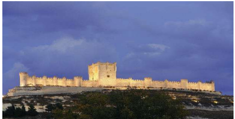
Castillo de Peñafiel, Valladolid

A land known for its wines and the birth of the Infante Don Juan Manuel, author of The Tales of Count Lucanor. Its castle, declared a National Monument in 1917, is currently the Provincial Wine Museum, and both the castle and the various wineries in the town offer wine tasting sessions and guided tours. In the Plateresque church of San Pablo, the chapel of Los Manuel tells the story of the chapel's five centuries of existence. The Casa de la Ribera is one of the best-preserved examples of traditional architecture, which provides a theatrical representation of everyday life at the turn of the century. We cannot leave without visiting the Plaza del Coso, the regional museum of sacred art and tasting the local speciality, roast suckling lamb.