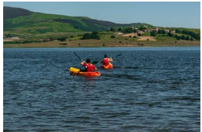
Playa de Arija, Burgos

Arija is a small village in the north of Burgos, on the border with Cantabria. Its location and climate make it an ideal place to enjoy nature all year round, with a complete tourist infrastructure: beautiful bathing areas, fine sandy beaches, a jetty, the Puntos Activos where one can receive information on active tourism in the region, recreational areas, a bird viewing area... It is the typical Burgos bathing area within the Official Census of Bathing Areas of Castilla y León. Its water has been rated as Excellent over the last few years by the General Directorate of Public Health of the Junta de Castilla y León, which evaluates the bathing waters of our community. Especially in the summer months, the waters of the reservoir are used for water sports such as canoeing and kitesurfing. The Ebro reservoir is also an ornithological paradise, where numerous species of birds, especially waterfowl, use its waters and wetlands as breeding and wintering grounds. This has led to its inclusion in the Natura 2000 Network and its declaration as a National Waterfowl Reserve, as it is one of the most important wetlands for waterfowl in Spain. It covers an area of more than 6,000 hectares and is 20 km long.