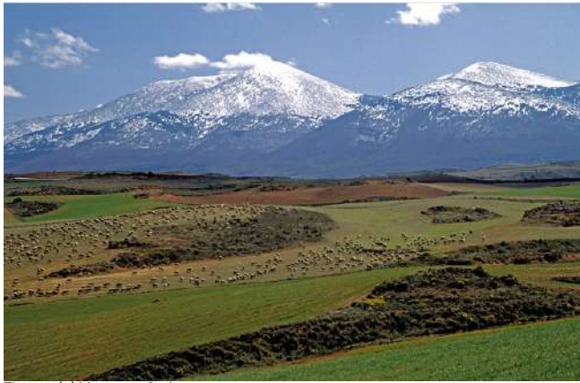
Tierras del Moncayo, Soria