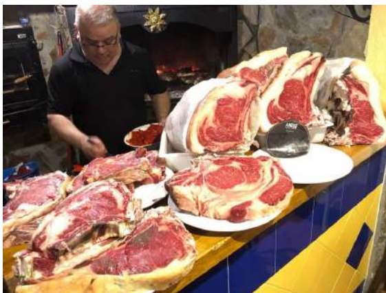
Indicación Geográfica Protegida (IGP) Ternera de Aliste, Zamora