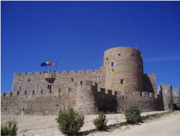
Castillo de La Adrada, Ávila