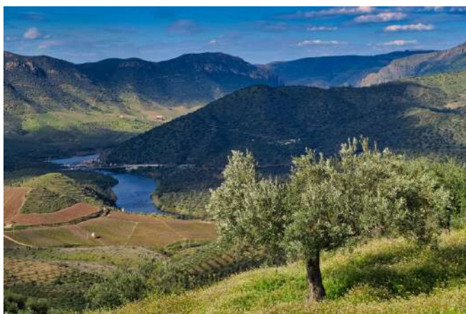
Río Águeda y Duero, muelle de Vega Terrón, Salamanca