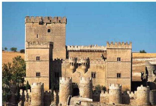
Castillo de Ampudia, Palencia

The 15th century Castle of the Sarmiento in Fuentes de Valdepero has many halls to visit, including the great hall which has an amazing exhibition of 10 models with hundreds of historical figures and events from Palencia fashioned from clay. Tel (+34) 687 93 07 38