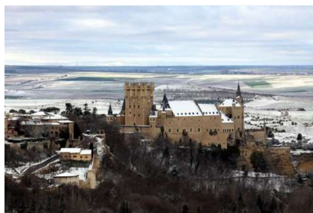
Alcázar de Segovia

Among the numerous Camino de Santiago routes we have in Spain, the Madrid Way is part of those known as the Caminos Tradicionales or Traditional Ways. It links Madrid and Santiago de Compostela in a route through the provinces of Segovia, Valladolid, and links up with the French Way in the province of León. Signage was added to the Way in 1996. It enters the province of Segovia along the Roman road from the Puerto de la Fuenfria mountain pass, passing through Valsain and past the Royal Palace of San Ildefonso, an iconic place to visit. It reaches the city of Segovia, crossing through the centre, before turning towards Zamarramala. Make sure to take in the fantastic views of Segovia from this spot! It continues on towards Valseca, travelling through the villages of Los Huertos, Añe, Pinilla Ambroz, and Santa María la Real de Nieva, where there are marvellous cloisters to visit. The next town on the journey is Nieva, with its white wine "Rueda" Denomination of Origin. After that is Nava de la Asunción, with its colourful walls, then Coca and its fantastic Mudéjar castle and Roman ruins. The final town before crossing into the province of Valladolid is Villeguillo. Remember to carry your Pilgrim's Passport and get it stamped in the different places you stop at and, lastly, as we say here, Buen Camino!