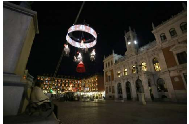
Festival Internacional de Teatro y Artes de Calle de Valladolid, TAC

The 23rd edition of this festival will run from 25 to 29 May in one of the biggest events of its kind in Europe. This event, organised by Valladolid City Council, includes different disciplines such as dance, music, circus acts, and especially theatre. It started out with two aims. Firstly, to promote new artists, who perform outside the walls of theatres, and secondly to give the city a different cultural experience with which to start spring. Over the event, companies from all over the world turn the streets of the city of Valladolid into one big show. The performances, aimed at all ages and tastes, are held in different areas, such as the Campo Grande park, calle (street) Santiago, and on the pavements in quiet spots, as well as many other places. Most performances are free, but some of them do charge, generally between €1.50 up to €20. For five days, the streets of Valladolid became a stage for this art, five days to soak up the show, and discover the other attractions the city has to offer.