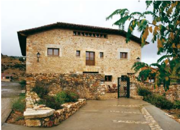
Posada Real Los Templarios, Ucero, Soria