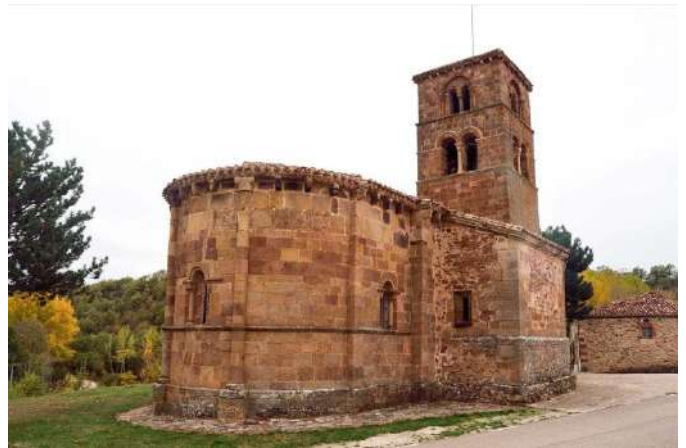
Iglesia de San Martín, Vizcaínos, Burgos

The magnificent porticoed galleries that we can find in the Sierra de la Demanda were a feature of the buildings that protected the faithful from the harsh winters in the mountains. The influence of various master craftsmen from the nearby Santo Domingo de Silos monastery can be appreciated in the churches in Vizcaínos, Jaramillo de la Fuente, and Pineda de la Sierra, which date from the late 12th century. The portico in Jaramillo de la Fuente comprises a central door with a semi-circular round arch and two traditional arches to the left and four to the right resting on coupled columns, in Vizcaínos the gallery features two arches and a door, linked by an impost, and the church in Pineda de la Sierra also displays a spectacular open porticoed gallery on the south wall. The town councils used to meet in these outdoor cloisters. There are also other interesting Romanesque churches in Neila and San Millán de Lara, for example.