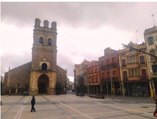
La Bañeza, León

The city of La Bañeza is located in the south of the province of León, in the county of Valduerna, and is one of the key sites on the Silver Way Route. In terms of heritage, it boasts museums such as the bean museum, which highlights the importance of this crop to the region dating back to the 16th century, and churches such as the 16th century church of Santa María and the church of El Salvador, which is tied to the city's Mozarabic origins. The city also has a large number of Modernist buildings. The best examples would be the Council building, the Pérez Alonso theatre, and the "La Única" Flour Mill, which still contains the original machinery and offers us the opportunity to find out about the history of the city of La Bañeza and the county. Additionally, the "Graffiti Tour" has gone from strength to strength in recent years. In this open-air museum we can discover immensely creative works on small walls and large façades. Turning to food, if there is one dish that stands out in La Bañeza as truly unique it is definitely the "frog legs in salsa bañezana (Bañeza sauce)". Another of the local star products are the imperiales (imperials), small sponge cakes made from almonds, eggs, and sugar.