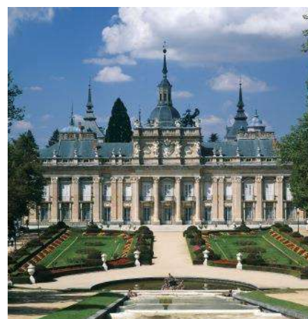
Jardines y fuentes La Granja, Segovia

This month we propose a visit to the Real Sitio de San Ildefonso in Segovia. Located just over 10 kilometres from Segovia city, we are sure it will surprise you! We suggest you visit the Royal Palace, it is a beautiful example of European palace architecture where you will be able to admire the throne room, the Japanese room, the gallery of statues or the house of the ladies, where the Tapestry Museum is located. Enjoy some fresh air by taking a quiet stroll through the gardens, where the monumental fountains are located. But there is much more to see in this city. You can't miss the Royal Glass Factory, an example of 18th century industrial architecture, where you can learn about the methods and processes for manufacturing glass. You cannot leave the town without first having walked through its streets.