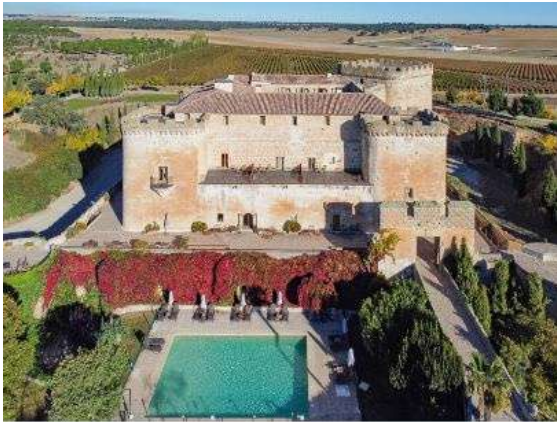
Posada Real Castillo del Buen Amor

If you are looking for an experience of complete immersion in nature and the authenticity of Castilla y León, we recommend a visit to the Posadas Reales, our very own quality brand within Rural Tourism! We offer excellent accommodation in several unique places and fantastic customer service. A perfect stay which will allow you to live an unforgettable experience, immersing yourself in all the activities, heritage and natural areas that Castilla y León has to offer.