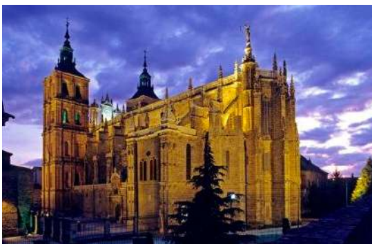
Catedral de Astorga, León