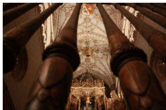
Catedral de San Antolín, Palencia

To visit Palencia is to take a break from the hustle and bustle of daily life. Enjoy a relaxing stroll through a city which possesses a rich artistic, natural and gastronomic heritage. You will be able to visit the Cathedral, which is popularly known as La Bella Desconocida [The Unknown Beauty]. It is one of the largest in Spain and it houses authentic treasures of the greatest masters. Of 7th century Visigoth origin, it covers various artistic styles up to the present day. This coming year 2021 will commemorate its 7th centenary since it first began being built in the 14th century; it is the ideal moment to come and get to know this Gothic wonder and participate in the many events that will take place during this year. If you are planning on coming soon, remember that on January 1st there will be a beautiful festival dedicated to the Baptism of the Child Jesus, declared to be of National Tourist Interest. This is a religious event organised by the Brotherhood of the Sweet Name of the Child Jesus, whose foundation dates back to the 16th century.