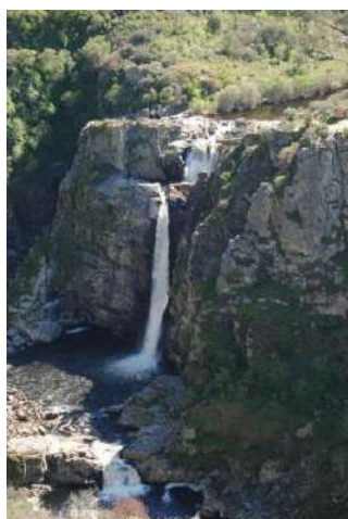
Pozo de Los Humos, Salamanca