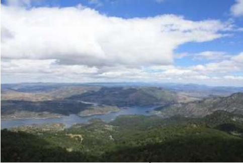
Embalse del Burguillo. Valle de Iruelas, Ávila