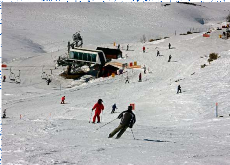
Estación de Esquí de San Isidro, León

In this December newsletter we would like to introduce you to some of the places in Castilla y León that are sure to surprise you and where you can enjoy nature, art, gastronomy and leisure to the fullest... in a safe and healthy way.