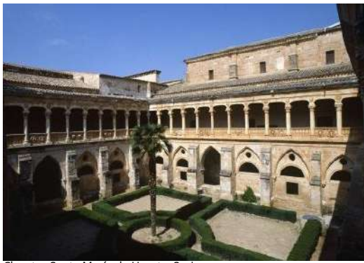
Claustro Santa Maria de Huerta, Soria