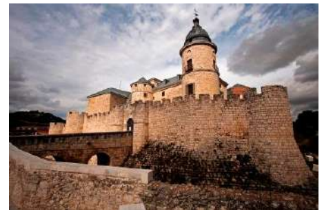
Castillo de Simancas, Valladolid

Valladolid has many castles of all periods and styles. A large catalogue of fortresses are distributed throughout the province, many of which have been restored and are used as museums, hotels or plants. We suggest that you visit the Mudejar Castle of La Mota in Medina del Campo, which was the home of Queen Isabella I in the last stage of her life. The Castle of Peñafiel, converted into a wine museum. The Castle of Simancas, which was converted into the General Archive; the Castle of Fuensaldaña, former seat of the Castilla y León Parliament; the enchanted Castle of Trigueros del Valle; the Castle of Íscar, today a brewery; that of Curiel, converted into a hotel; and many others such as Portillo, Montealegre, Tiedra, Torrelatón, Encinas, Villafuerte, Urueña, Villalba de los Alcores, etc. A fantastic proposal for the whole family.