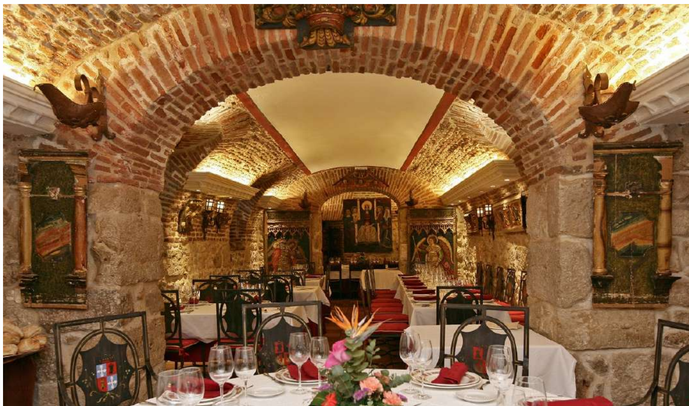
Restaurante La Parrilla de San Lorenzo, Valladolid

Castilla y León has a rich gastronomic heritage, favored by its extensive and varied recipe book, but also by the quality and diversity of its provisions, with over 60 products guaranteed by any quality designation. Due to the combination of all this potential arose the Brand RESTAURANTE DE LA TIERRA, in order that the restaurants of Castilla y León are direct and active part in spreading the excellence of our gastronomic tourism.