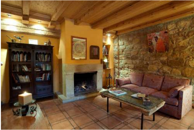
Posada Real La Posada del Pinar, Pozal de Gallinas, Valladolid

For a fully immersive experience involving the nature and authenticity of Castilla y León, we recommend Las Posadas Reales, our high-quality rural tourism brand! Not only will you stay in singular buildings, but excellent accommodations and service are guaranteed! They are the perfect place to stay for an unforgettable experience, immersing yourself in all the activities, heritage and nature of Castilla y León.