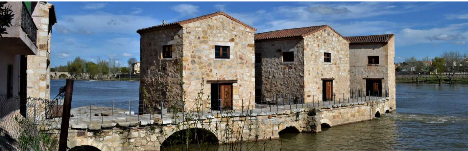
Aceñas de Olivares, Zamora