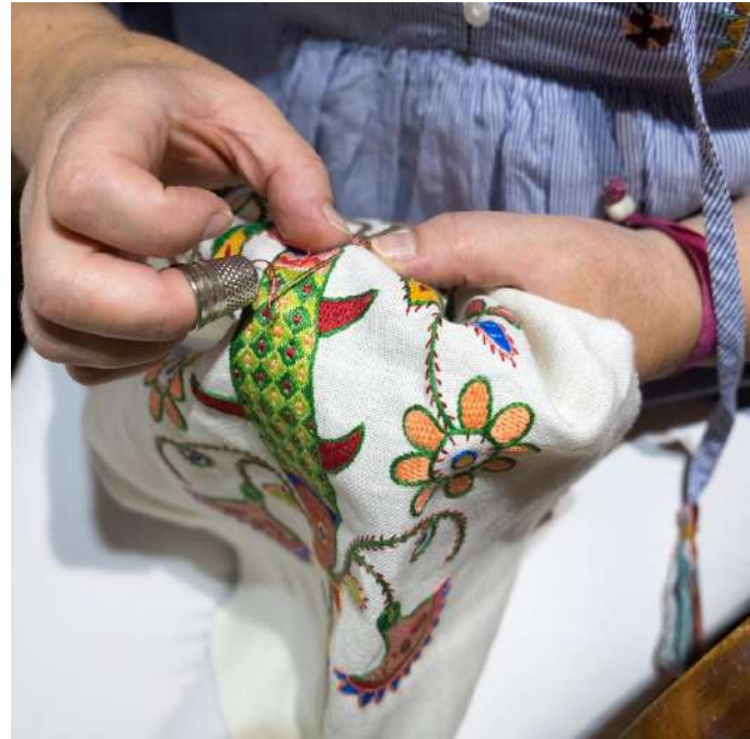
Bordado Serrano, La Aberca, Salamanca

One of the typical crafts of the Sierra de Francia is embroidery, which can be seen in scarves, bedspreads, tablecloths and so on, and is part of the identity of the villages of the Sierra de Francia. The technique, the motifs and the choice of colours have been handed down from generation to generation. Embroidery is usually done on linen or taffeta using primary-coloured threads. The most recurrent symbols are: A heart from which a flower blooms, representing love; the two-headed eagle, symbolising marriage; fertility, represented by the trout; the lion, symbolising man, an expression of virility, and the single-headed bird, representing woman; the tree of life, enveloping the whole, representing health and longevity. These wonders are displayed on the balconies on feast days or on altars on days such as Corpus Christi.