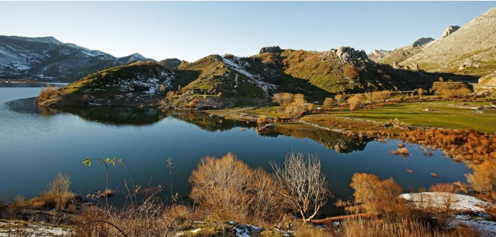
Valle de Luna. León

Biosphere Reserves are areas designated by UNESCO under the MAB (Man and the Biosphere) Programme with the intention of harmonising conservation of natural resources with human well-being.