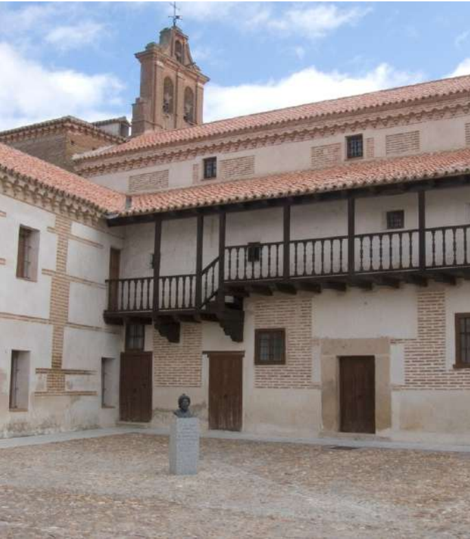
Monasterio de Nuestra Señora de Gracia, Madrigal de las Altas Torres, Ávila