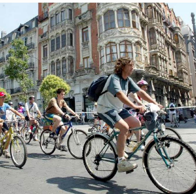
Celebración en Valladolid del Día de la Bici