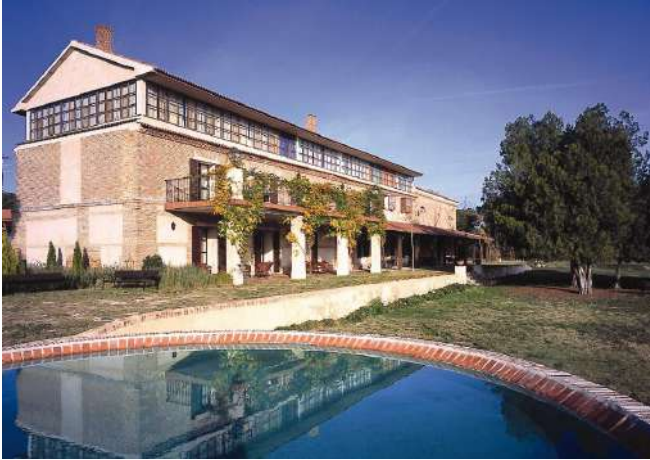
Posada Real La Posada del Pinar, Pozal de Gallinas, Valladolid

For a fully immersive experience involving the nature and authenticity of Castilla y León, we recommend Las Posadas Reales, our high-quality rural tourism brand! Not only will you stay in singular buildings, but excellent accommodations and service are guaranteed! They are the perfect place to stay for an unforgettable experience, immersing yourself in all the activities, heritage and nature of Castilla y León.