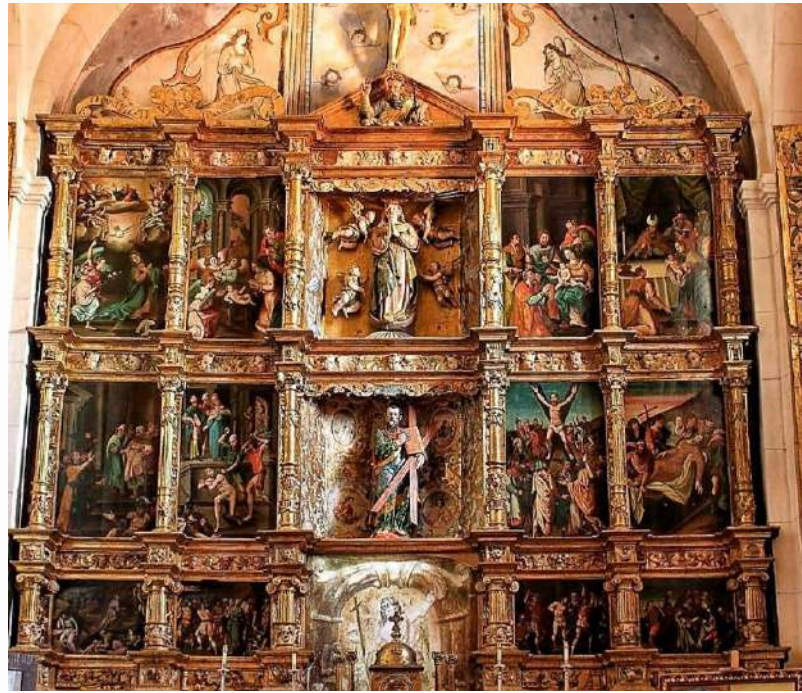
Retablo de la iglesia de Valdescapa, León

In some of the many churches located in the numerous villages of the province of León, we can find true marvels, authentic works of sacred art. Ten of them form the "Renaissance altarpieces route of eastern León". 76 kilometres link the towns of Vallecillo, Gordaliza del Pino, Sahagún, Joara, Celada de Cea, Valdescapa de Cea, Villaselán, Valdavidia, Cistierna and Yugueros; the Route crosses the valleys of the rivers Esla, Cea and Valderaduey. This route through the ten villages also allows you to discover the local gastronomy and its different traditions.