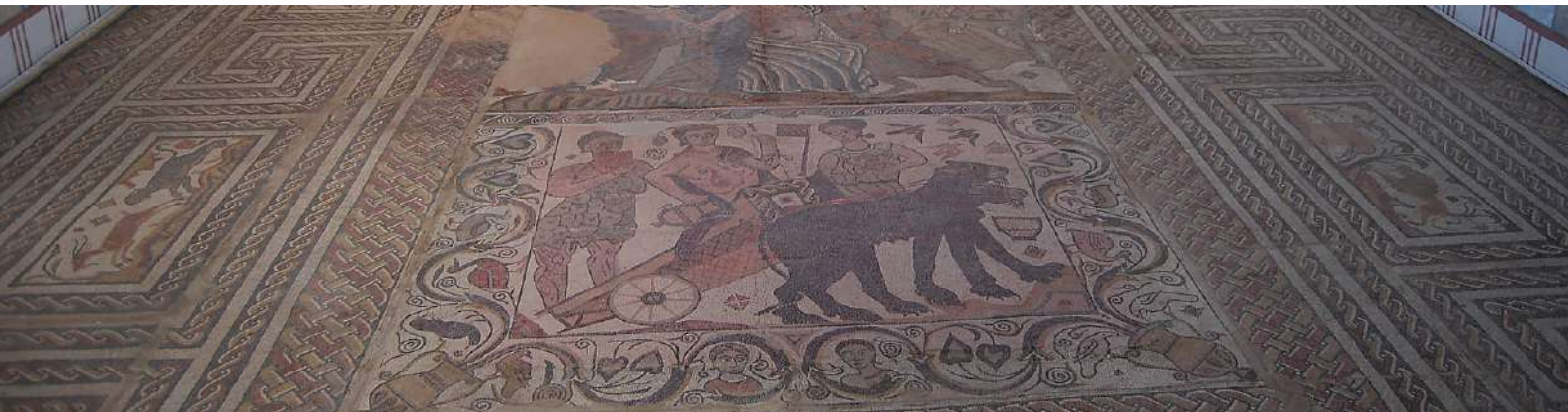
Villa romana Baños de Valdearados, Burgos