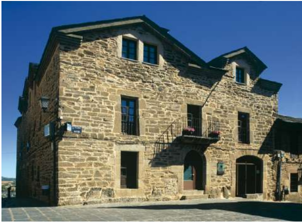
Posada Real de Las Misas, Puebla de Sanabria, Zamora

For a fully immersive experience involving the nature and authenticity of Castilla y León, we recommend Las Posadas Reales, our high-quality rural tourism brand! Not only will you stay in singular buildings, but excellent accommodations and service are guaranteed! They are the perfect place to stay for an unforgettable experience, immersing yourself in all the activities, heritage and nature of Castilla y León.