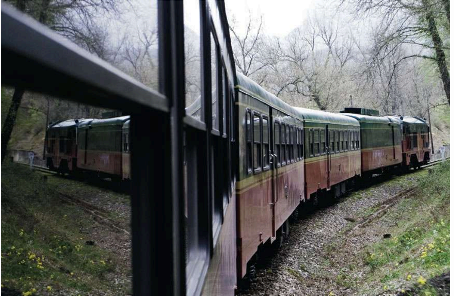
Tren Hullero de La Robla, León

The La Robla train was built in 1894 to transport coal production from the mining basins of Leon and Palencia to the powerful steel industry of Vizcaya. In addition to coal, it also transported passengers. This railway line suffered several crises and abandonments over the years and, finally, in 2009 Renfe recovered it for tourist use with a four-day route.