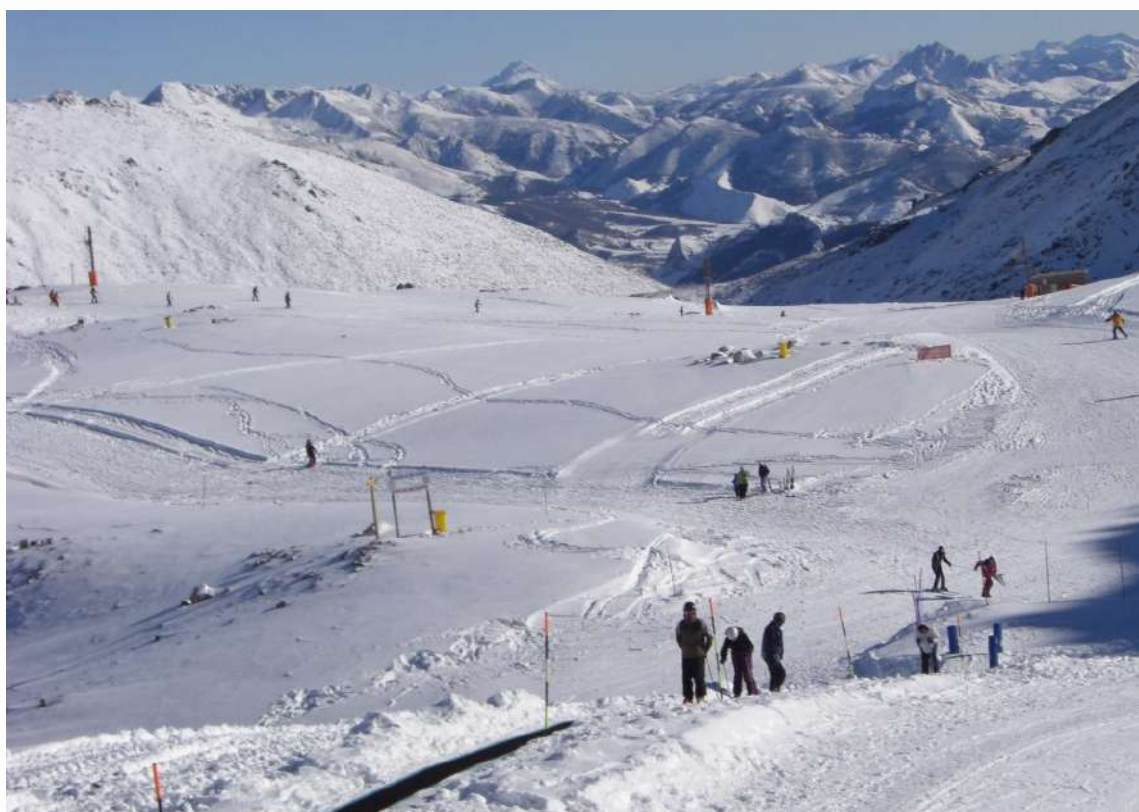
Estación de esquí San Isidro, León

La práctica del esquí es uno de los atractivos del turismo invernal en Castilla y León. Las cumbres de las cadenas montañosas se transforman con las primeras nieves del invierno en un lugar extraordinario y privilegiado para la práctica de este deporte.