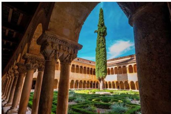
Posada Real Convento San Francisco, Santo Domingo de Silos, Burgos

For a fully immersive experience involving the nature and authenticity of Castilla y León, we recommend Las Posadas Reales, our high-quality rural tourism brand! Not only will you stay in singular buildings, but excellent accommodations and service are guaranteed! They are the perfect place to stay for an unforgettable experience, immersing yourself in all the activities, heritage and nature of Castilla y León.