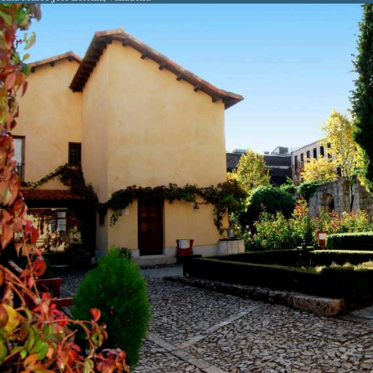
Casa Museo José Zorrilla, Valladolid

Currently, the city of Valladolid dedicates three of its museums to famous writers and prominent historical figures. The Cervantes House Museum, where the writer lived in the early 17th century, stands as Spain's only preserved residence of the literary figure in its original form. It preserves his family documents and faithfully recreates the spaces from his time. Christopher Columbus passed away in Valladolid in 1506. His House Museum, inspired by his son Diego Colón's viceregal palace, honours the navigator and recounts his discoveries. It features maps from the colonial era and artefacts from Inca, Aztec, and Maya cultures. The Zorrilla House Museum captures the romantic ambiance of the 19th century, with its garden being one of the city's most enchanting spots. José Zorrilla, renowned for "Don Juan Tenorio," was born in this house, spent his childhood here, and returned in adulthood. The museum showcases documents, manuscripts, furniture, and personal items donated by his widow. Throughout the year, all three museums actively promote and host cultural events focused on literature, poetry, and theatre.