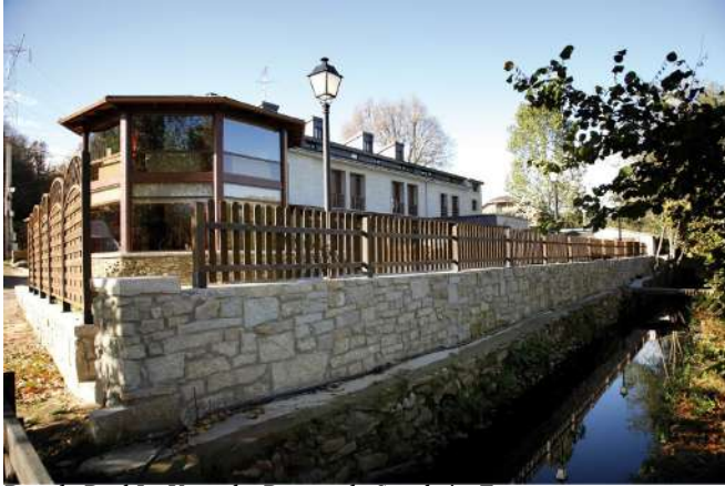
Posada Real La Yensula, Puente de Sanabria, Zamora

For a fully immersive experience involving the nature and authenticity of Castilla y León, we recommend Las Posadas Reales, our high-quality rural tourism brand! Not only will you stay in singular buildings, but excellent accommodations and service are guaranteed! They are the perfect place to stay for an unforgettable experience, immersing yourself in all the activities, heritage and nature of Castilla y León.