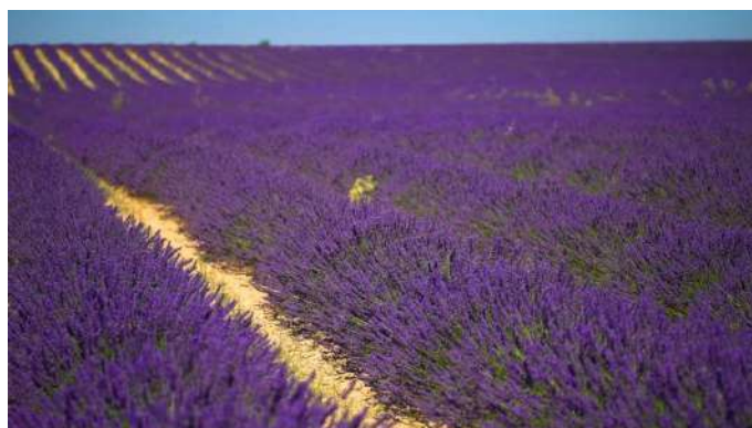
Campos de Lavanda, Burgos

Summer is the season of the year when you can enjoy the flowering of sunflowers and lavender in the province of Burgos. Lavender fields can be found in places such as the Arlanza area, in towns like Villaviado, Castrillo Solarana and Mecerreyes or in the north of the province, in the area of Santa Gadea del Cid. The flowering takes place during July and the first days of August. The landscapes, with the plants perfectly arranged in rows and their distinctive shades of "lavender", are a wonderful sight to behold. Sunflowers flower later, during the month of August, and can be found in many parts of the province, occupying many more hectares than lavender. The region of La Bureba is one of the areas where you can enjoy the best views of the fields full of yellow flowers. Both alternatives are great opportunities to enjoy our nature in the summer in a different and peaceful way, far from crowded places.