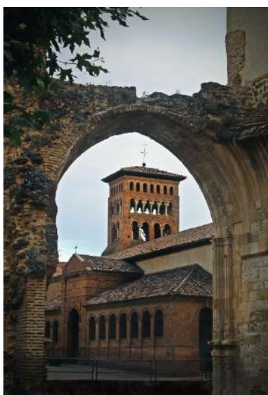
San Benito y Torre San Tirso, Sahagún, León

Coinciding with the celebration of the Jacobean Holy Year 21-22 and the VIII Centenary of the construction of the Cathedral of Burgos, the twenty-fifth edition of the Ages of Man "Lux" (Edades del Hombre "Lux") takes place in five exhibition venues in Burgos, Carrión de los Condes (Palencia) and Sahagún (León). In Sahagún, two Mudejar temples house the exhibition: San Tirso and the Sanctuary of La Peregrina, where some 50 works of art are arranged around two themes: "Mater Misericordiae" and "Salve, Regina". The town preserves an important artistic heritage, of which the remains of the monastery of San Benito, the museum of the Benedictine nuns and the Mudejar church of San Lorenzo, from the 13th century, stand out. Just 5 km from Sahagún we find the monastery of San Pedro de Dueñas, whose Mudejar church has an exceptional collection of capitals and a crucifix by Gregorio Fernández. From there we can head towards Grajal de Campos; where we can still enjoy its palace, the artillery castle and the church of San Miguel, dating from the village's most prosperous period. In the area we can also visit the wineries of the D.O. León, in the town of Joara there are tastings and visits to the Julio Crespo winery.