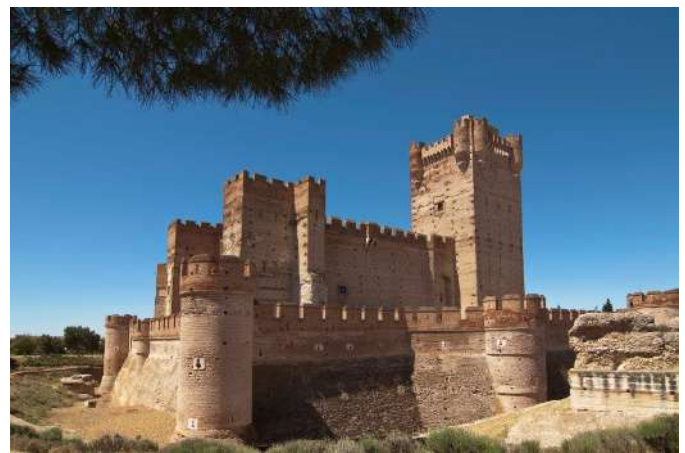
Castillo de la Mota, Medina del Campo, Valladolid

Valladolid is not only a land of wines but also of kings, with a total of 22 castles scattered throughout the province. If there is one thing they all have in common, it is their breathtaking views, an infinite landscape of the Castilian countryside. Among the most important and best-preserved, we find the castle of Peñafiel, now a provincial wine museum, unmistakable for its distinctive boat shape. In Villafuerte de Esgueva, we have the opportunity to go on a very realistic themed tour. If what you want is to live a royal experience, you can stay in the Curiel Castle complete with all kinds of features of the time, you will feel as if you were back in medieval times. The Fuensaldaña castle is home to the interpretation centre of the castles of Valladolid. There are also castles worthy of epic films, such as Torrelobatón, where Charlton Heston and Sofia Loren filmed the movie "El Cid". Made of ashlar stone in the pure medieval style or of brick in the Mudejar style, they have now been converted into artisan breweries, archives housing documents since the time of the Catholic kings, enchanted castles... we could spend all day telling you about them, but hearing about them is nothing but a whisper to seeing them in person.