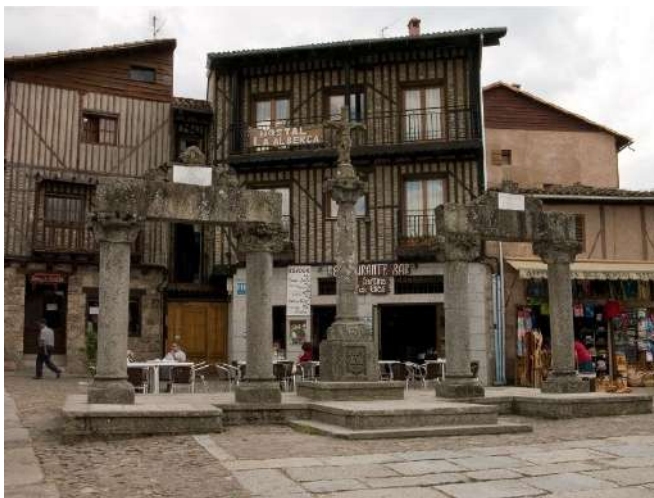
La Alberca, Salamanca