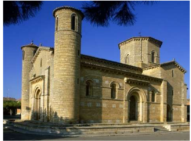
San Martín de Frónista, Palencia

The Middle Ages left Palencia one of the most extensive and important Romanesque sites in Spain. Not only for the quality of its buildings but also the quantity, being the province with the highest concentration of Romanesque temples in Europe. Two important events made this possible: on the one hand, the restoration of the diocese of Palencia in 1035 under Sancho III El Mayor (The Great). And on the other hand, the Camino de Santiago, which would open up a means of communication with the rest of Europe, both on an artistic level with the arrival of new construction trends, and on a spiritual and religious level, with this pilgrimage route to the tomb of the Apostle St. James, and of course the commercial and economic importance that would arise as a result of it. This summer, make the most of the special opening hours and discover the artistic treasures of this Romanesque period, marvellous hidden spots that will undoubtedly amaze you.