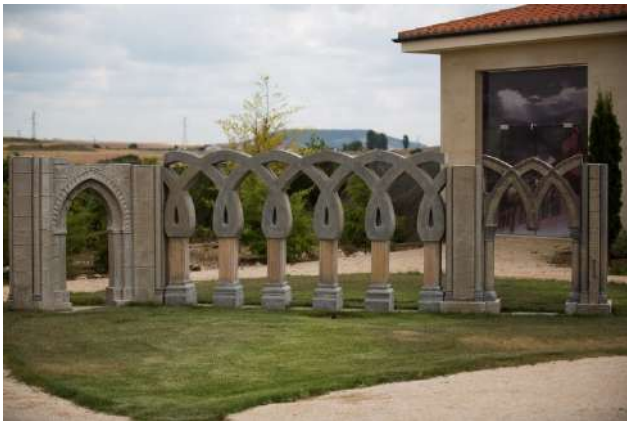
Museo Romanico, San Esteban Gormaz, Soria