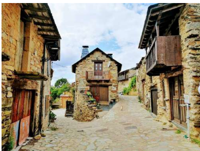
Santa Cruz de los Cuérragos, Zamora

To the west of our province and on the border with Portugal is a village declared of Tourist Interest in the category of Ethnological Ensemble by the Junta de Castilla y León. It is located at the confluence of three districts of Zamora: Aliste, Sanabria and Carballeda, which highlights its frontier nature. This complex is a unique case of preservation of the popular architecture of the sierra, adapted to its natural conditions, as well as to the traditional uses of the materials that predominate in the area. Another marvellous place to discover.