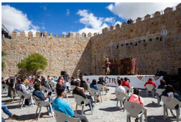
Festival Circo, Ávila