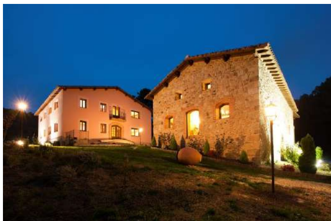
Posada Real del Infante, Arenas de San Pedro, Avila