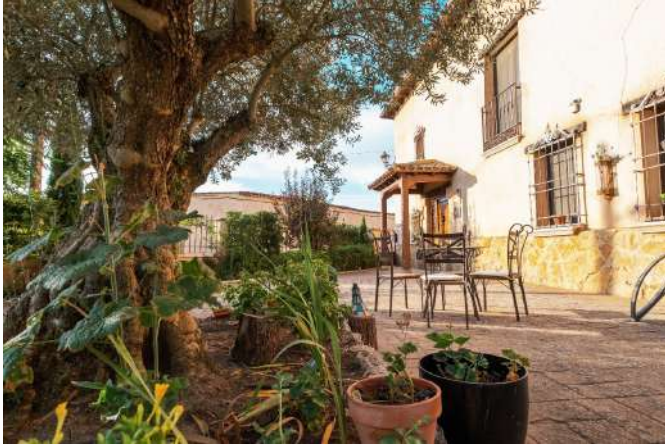
Posada Real La Posada del Canal, Villanueva de San Mancio, Valladolid

For a fully immersive experience involving the nature and authenticity of Castilla y León, we recommend Las Posadas Reales, our high-quality rural tourism brand! Not only will you stay in singular buildings, but excellent accommodations and service are guaranteed! They are the perfect place to stay for an unforgettable experience, immersing yourself in all the activities, heritage and nature of Castilla y León.