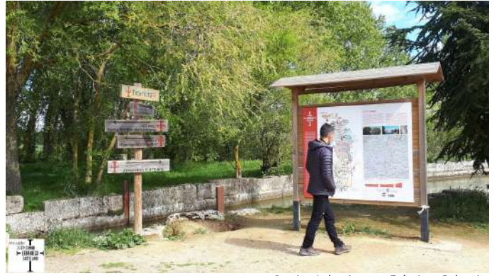
Camino Lebaniego en Frómista, Palencia

The Lebaniego Jubilee Year refers to a year in which 16 April, the day when the feast of Santo Toribio is celebrated, falls on a Sunday. The celebration of the Holy Lebaniego Year started in the 16th century with the bull issued by Pope Julius II on 23 September 1512, which granted the privilege of celebrating the Holy Lebaniego Jubilee Year. The last one was in 2017 and 2023 will be the 74th holy year to be celebrated. The “Camino Lebaniego Castellano” is a cultural walking route between the city of Palencia and the Monastery of Santo Toribio de Liébana in Cantabria. This traditional pilgrim’s route was already mentioned in 1455 and appears in the Book of Records of Palencia Cathedral. The “Camino Lebaniego Castellano” starts at the wharfs of the Canal of Castille in Palencia and uses its towpaths or paths on the first stretch, following the roads left by the Romans in the towns of La Pernía, the “Burejo” road, which began in Pisoraca (Herrera de Pisuerga) and crossed into Cantabria via the Piedrasluengas Pass. Get your walking boots out and ask us for your Pilgrim Passport to stamp as you make your way along this fantastic pilgrim’s route.