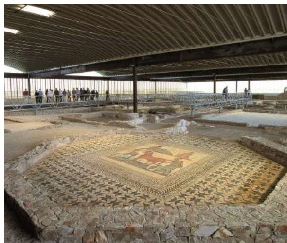
Museo Villas Romanas, Almenara, Valladolid

The Museum of Roman Villas and the Roman Villa in Almenara-Puras were classed as "Sites of Cultural Interest" in 1994. The house was built in the 4th century and inhabited until the 5th century. A visit to the villa takes in the different rooms, with mosaic floors and some of the original paintings on the walls and gives an insight into what life in the countryside was like at that time. There is a total of 400 m 2 of mosaics, of which the most important one is called "Pegaso" (Pegasus). There are also some baths which have a frigidarium and caldarium, the latter of which has underfloor heating. You enter through a hall which ends in a large trefoil plan room. This villa has a lot for children to enjoy, as they can also play on a themed playground outside.