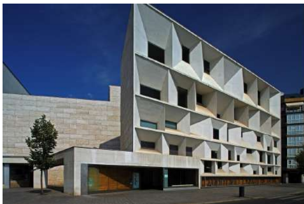
Auditorio Ciudad de León