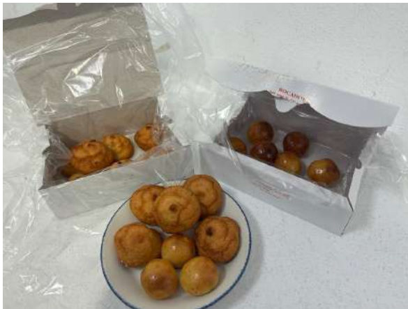
Dulces conventuales salmantinos