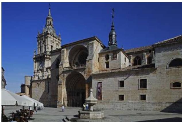
Catedral de El Burgo de Osma. Soria