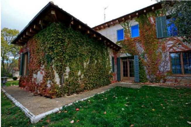
Posada Real Finca Fuente Techada, Sotosalbos, Segovia