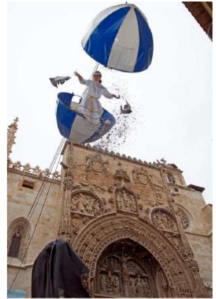
Bajada del Angel, Aranda de Duero, Burgos

The most eagerly awaited moment of Easter Week in Aranda de Duero is the Descent of the Angel, which has been classed as a National Tourist Attraction. On Easter Sunday, which falls on 9 April this year, a boy or girl, dressed as an angel, descends on a cable inside a blue and white balloon from the beautiful facade of the church of Santa Maria. When they are above the image of the Virgen de la Candelas, the balloon opens and the Angel circles down to pull back the black mourning veil covering the carving, in celebration of the joy of the Resurrection of Christ, whose image was previously placed next to that of his mother across from the church. Later on, the Angel takes part in the procession below the platform of the Virgen, proudly carrying the black veil that they removed earlier and warmly waving to all the attendees.