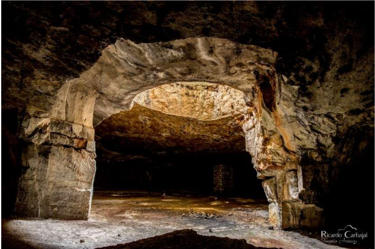
Galería de la Luz, Hontoria de la Canteras, Cubillo del Campo y Tornadijo, Burgos