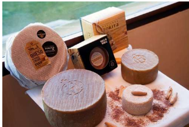
Queso curado de leche de oveja de Hacienda Zorita