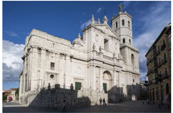
Fachada principal Catedral de Valladolid

This is most certainly one of the crown jewels of the city of Valladolid. King Phillip II, who was born in the city, did not wish to die without leaving his city a cathedral of its own. So, in 1582 work started and in 1595 it was granted cathedral status, as it had previously only been a collegiate church subordinate to the diocese of Palencia. The architect Herrera died in 1597 and Phillip II died in 1598. The project was highly ambitious, aiming to be one of the biggest cathedrals in Christendom. However, it was never finished due to a lack of funds. Before the Renaissance there were 3 collegiate churches. The first two were Romanesque and the final one was Gothic. Traces of the latter still stand in the gate tower and the galleries of the present day religious art museum. There was a tower alongside the current one, called the tower of the "Buena Moza" (Good Young Lady) as it was the tallest and slimmest of its age. A fierce storm brought it down in 1841 which led to the start of work on the current one in the 19th century, which was finished by the addition of a statue of the Sacred Heart in 1923.