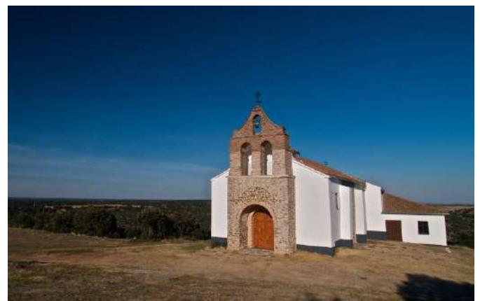
Ermita del Cerro del Castillo Bernardos, Segovia

The Cerro del Castillo archaeological site is located in the area of Bernardos, in the valley of the river Eresma, the main route between the large Roman cities of Coca and Segovia. We can find an extraordinary late Roman fort there which was classed as a Site of Cultural Interest in 2006. The Hispano-Romans of the area made a strategic decision to live there in great numbers around the 5th century C.E. The site would later be reinforced with a large stone wall, which was over three metres wide and was guarded by semi-circular towers all along the perimeter. This site was still inhabited in the Visigoth era and in the early stages of the Muslim invasion of Spain, when significant changes were made to the walls. Visitors can find more information on the area on boards at the Bernardos Town Hall to help with their visit. The Virgen del Castillo shrine is also worth highlighting. The journey of the Virgen up to the shrine takes place every ten years. Other points of interest in this town include the 16th century church, the Humilladero shrine, the shrines of Santa Inés and San Roque, the latter of which has a permanent exhibition on the textile industry.