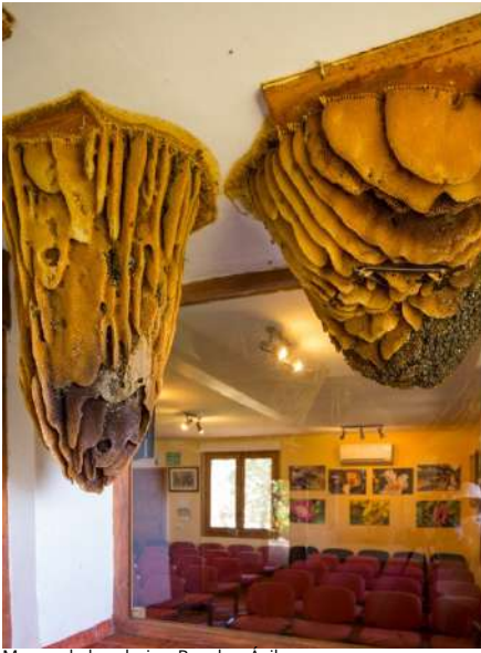
Museo de las abejas, Poyales, Ávila

Abejas del Valle (Valley Bees) is a Workshop-Museum designed for learning about the world of bees where you can take a completely safe look at these industrious insects. Having the chance to take a close look at bees in action as they work freely in their natural environment makes this original living museum an unbeatable one of a kind place. This is not just any museum, it's a place where you have the chance to figure out the mysteries of the hive and its perfectly organised society. Experience of the world of bees up close, discover how they live and work, and their relationship with humans. Examine hanging hives and see images of how the queen lays her eggs, how drones feed, and how worker bees gather honey and pollen. This is all accompanied by explanations from an expert beekeeper. There is also an exhibition on beekeeping in the past: traditional hives from all over the Iberian peninsula and Morocco, extractors, bee suits, honeypots, smokers, and other beekeeping tools.