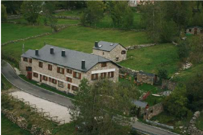
Posada Real El Rincón de Babia, La Cueta, León