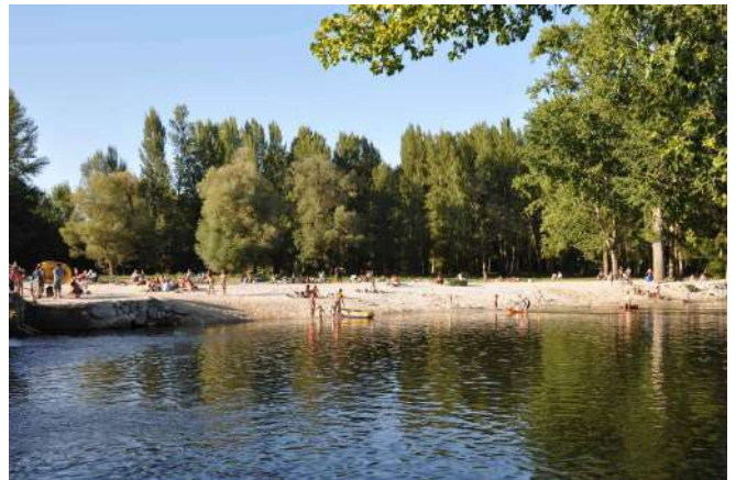
Piscinas Naturales del Nela, Villarcayo, Burgos

The town of Villarcayo, in Las Merindades county, features the river Nela as an interesting way to enjoy the great outdoors all year round, especially in summer when swimmers flock to the natural pools in El Soto Park. This large outdoor area has natural bathing areas, gardens, green spaces, children's facilities, and rest areas. The perfect place to have a good time. It has been added to the official register of Bathing Areas in Castilla and León this year.