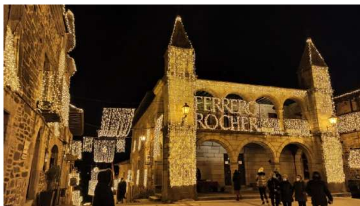
Luces de Navidad, Puebla de Sanabria, Zamora

If we had to choose one town for a perfect Christmas, that would, without a shadow of a doubt, be Puebla de Sanabria in Zamora. Declared one of the prettiest towns in Spain, it boasts some of the best Christmas lights in the whole of Spain. The main square, the surrounding streets, and the castle all bathe you in their warm golden light. The wooden and stone houses, the balconies, the views, the food, and the people do the rest. A wonderful location nestled in the heart of the Lago de Sanabria Natural Park and the Segundera and Porto mountain ranges, the biggest glacial lake in Spain, the more than twenty glacial lakes, nature, food, snow, wolves, deer, sailing on the lake in the Helios Cousteau, the world's first wind and solar-powered catamaran; pulling on your winter boots to hike to the beautiful waterfalls in Sotillo or the forest in Tejedelo, where you feel like you're stepping into a world of fairy tales and elves all make this the ideal place to spend the Christmas holidays.