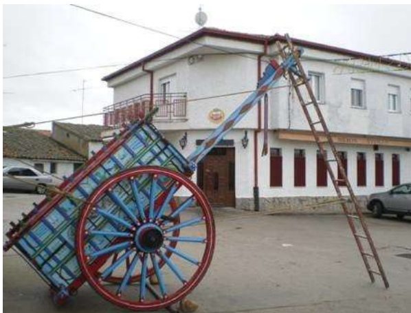
Fiesta de La Horca, Valdecarros, Salamanca

From 17th December to 4th January Closed on 24th and 31st December Opening hours 6:00 p.m. to 9:30 p.m. Free entry