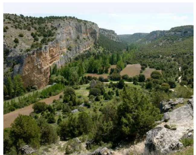
Hoces de Riaza, Segovia

The Hoces del Riaza Natural Park lies in the north-east of the province. The most interesting aspect of this stunning spot, besides the astonishing canyon, is the vast diversity of the birds there, especially birds of prey, including the colony of Griffon vultures, which is one of the biggest in Europe. There are many ways to explore this area but we would suggest three main areas. Firstly, the path between Maderuelo and the Linares del Arroya dam which is a relatively smooth climb. Secondly, the stretch between the dam and the stream at El Casuar where the river forms a canyon in the limestone that is 150 metres deep and around 250 metres wide. And, lastly, the fertile valley, nestled between the river and Montejo de la Vega de la Serrezuela. Yet, as well as savin junipers, holm oaks, gall oak groves, shrubland, the fauna including mostly birds such as the Griffon vulture, the Egyptian vulture, the common kestrel, the bird population of ducks, grey herons, and the limestone geological features, we also have cultural heritage nearby in El Casuar shrine, the remains of the church in Linares del Arroyo, and villages full of monuments, such as Maderuelo, which is listed as a Historic Site.