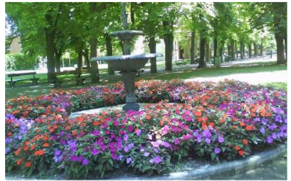
Bosque Mágico Huerta Guadián, Palencia

An exciting adventure designed exclusively for the city of Palencia, and the only one of its kind in Castile and Leon!