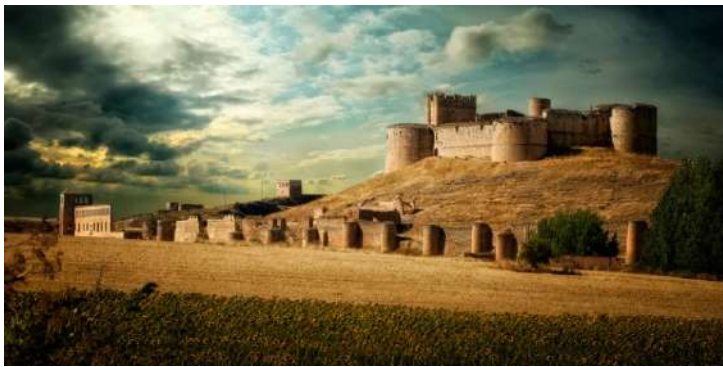
Castillo de Berlanga, Soria