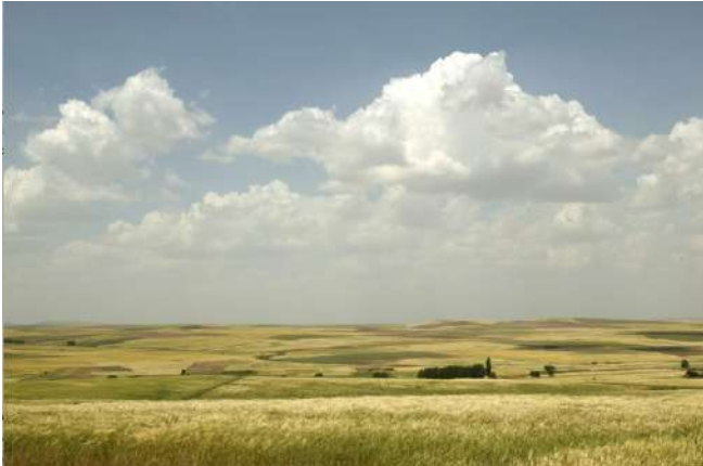
La Moraña, Avila