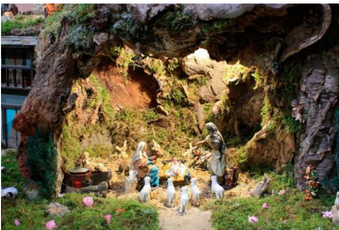
Nacimiento de Folgoso de la Ribera, León

There are numerous nativity scenes to be found in the province of Leon over the Christmas period, but some of them stand out for their history and tradition. Our journey starts in the region of Bierzo, in the Villaverde de la Abadia church where we visit a 70m long nativity scene with both moving and static figures. In Cabañas Raras, their traditional nativity scene made from stone and mud includes more than 1,000 pieces and in Folgoso de la Ribera the nativity scene, which has been declared a Regional Tourist Attraction, depicts trade and life in Bierzo. Next, we carry on our trip by crossing the Maragatería, in Astorga, where one of the finest examples can be found in the nursing home there. Heading to the South now, in Robledo de la Valduerna, we come to La Casa del Belén, a collection of dioramas and nativity scenes from all over the world that is a real treat for everyone who loves nativity scenes. The Church of San Salvador in La Bañeza has a fine example every year. In Leon, two wonderful nativity scenes are housed in the Church of Santa Marina and in the Capilla del Nacimiento in the Cathedral. Lastly, we end our tour in Cerezales del Condado, a town whose residents have worked meticulously every year to create one of the province's leading nativity scenes.