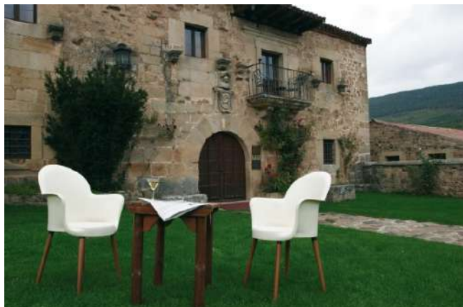
Posada Real de la Mesta, Soria