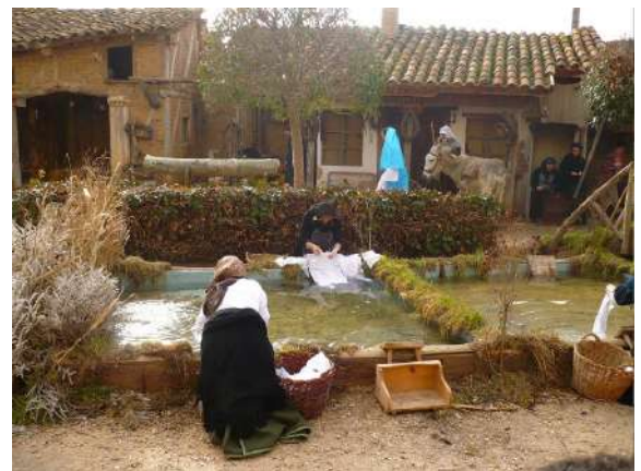
Belén Viviente, Cabezón de Pisuerga, Valladolid

In the Christmas season, the province of Valladolid transforms into the ideal setting for living nativity scenes. There are various towns we can visit to see these wonderful spectacles. It is the residents of these towns and cultural association who give up their own time to work on this delightful folk custom, as the tradition is very deep-rooted in the region. Most of them are on a stage but they all share the same idea, one way or another, of depicting the birth of Christ, and other biblical events such as the Annunciation, Mary and Joseph reaching Bethlehem, and the Adoration of the Three Kings. We must make special mention of the people in our region, where great importance is given to traditional Castilian crafts. Their popularity and prevalence have grown significantly in recent years, as they hold an important place in tradition and, above all, because of their religious symbology. They are not only a delight for adults, children also love them, as it is one of the best ways for them to understand the meaning of the holidays since the best way to learn is by experiencing it for themselves.