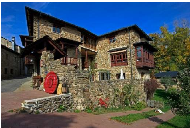
Posada Real El Sendero del Agua, Zamora