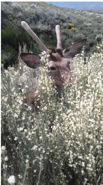
Ciervo en Puebla de Sanabria, Zamora

The northwest corner of the La Culebra mountain range in Zamora is one of the places chosen by nature lovers to have a front row seat to the deer's courtship. The rutting season, something exceptional for the occasional tourist, is a September wildlife spectacle eagerly awaited by the inhabitants of rural areas, even if some cannot sleep because of the nearby bellowing of the males. In order to listen to the deer bellowing, it is necessary to visit the Reserve in late September and early October.