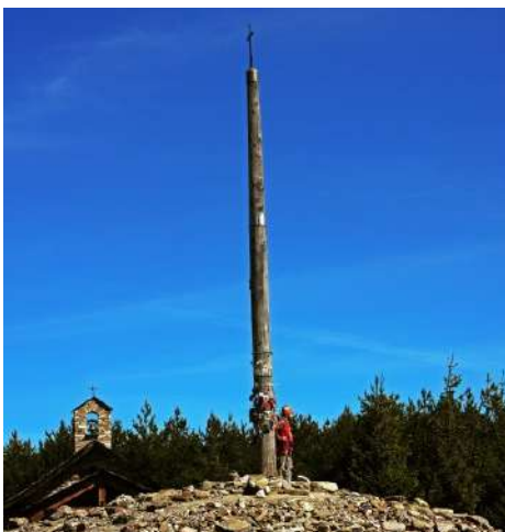
Cruz de Ferro, Santa Colomba de Somoza, León

The French Way of St. James passes through part of the Maragatería region and many pilgrims have been passing through its towns and villages since time immemorial, marvelling at its traditional architecture and the variety of its natural landscapes. The section of the Way in the region begins in Astorga and ends in Rabanal del Camino. Astorga is a must-see, where the Museo de los Caminos allows us to visit Gaudí's Episcopal Palace. Before reaching Murias de Rechivaldo we can make a detour to visit one of the most outstanding localities of the Maragata muleteers, Castrillo de los Polvazares, in one of its courtyards. Our route continues through Santa Catalina de Somoza and El Ganso.