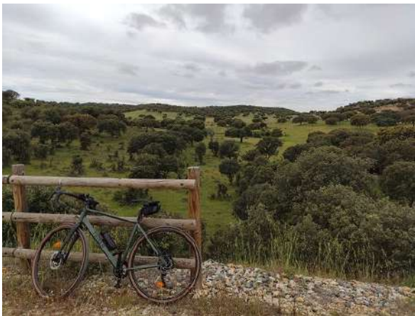
Vía Verde, Salamanca