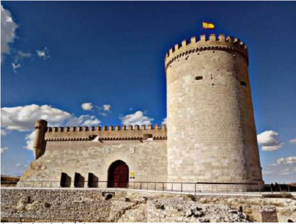
Castillo de Arévalo, Ávila