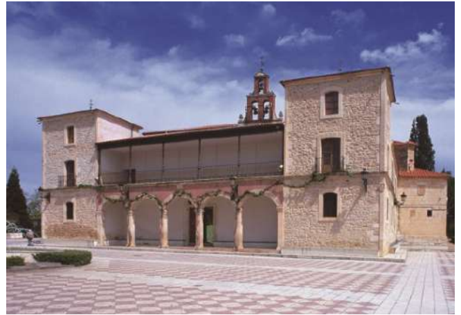
Nuestra Señora de las Viñas, Aranda de Duero, Burgos

The town of Aranda de Duero is located in the extreme south of the province of Burgos. In 2020 it was elected European City of Wine by the European Network of Wine Cities (RECEVIN). Due to the pandemic, it will also hold this distinction for 2021 and 2022. Its privileged geographical location has made it the capital of the Ribera del Duero. In addition to the church of San Juan, at the end of the 15th century the spectacular church of Santa María was built, with its outstanding main façade, a late Gothic work attributed to the Colonia family. The 15th and 16th centuries were the most prosperous for Aranda, becoming a focus of attraction for the noble families of the region, where they were encouraged to build their palaces and manor houses, with the house of the Berdugo family standing out among them all. In the Main Square you will find the Interpretation Centre of Wine Architecture (CIAVIN in Spanish), where you can learn about the traditional architecture related to wine.