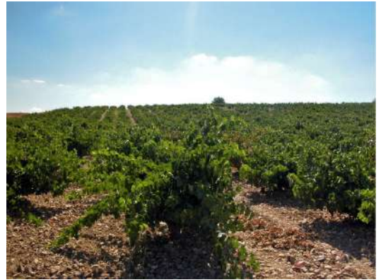
Viñedos en Palencia

This month enjoy all the harvest activities.