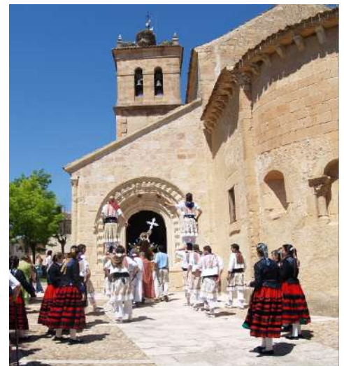
Danza El Arco, San Pedro de Gaillos, Segovia