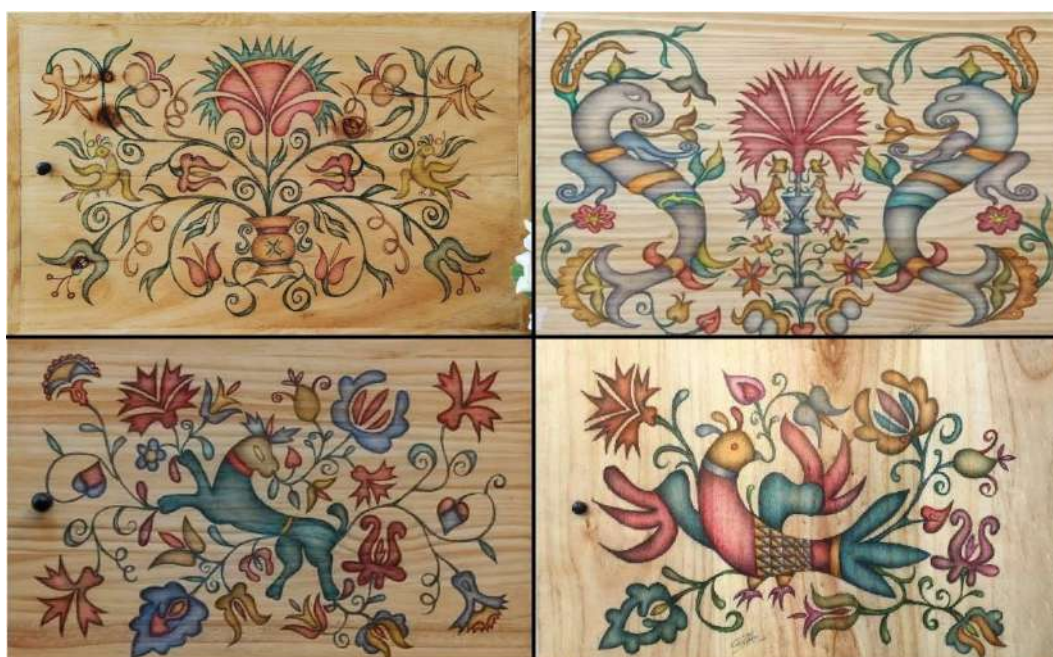
Ruta de los Contadores Bordados, San Esteban de la Sierra, Salamanca

https://www.turismocastillayleon.com/turismocyl/en