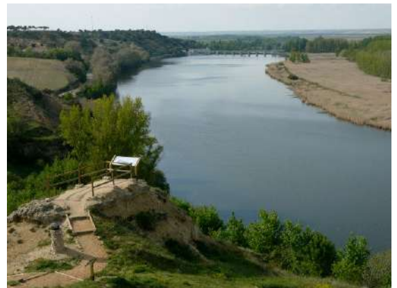
Riberas de Castronuño. Valladolid

The banks of Castronuño, the only area in the province included in the network of natural spaces, have a great natural and ethnographic wealth. Its importance lies mainly in the nesting and wintering of many birds. All this is due to its extensive forest made up of different varieties of trees such as poplars, black poplars, willows and ashes among other varieties, with more than 8400 hectares. The park house has a viewpoint from where you can see the meander of the Duero River, one of the largest in Europe, and inside you can see the birds live through cameras that continuously record the river. From here you can also follow a route through almond groves where you can see the local flora and fauna. In short, Castronuño is a good choice to spend a day in the heart of nature, both with your partner or family, as even the little ones will enjoy it.