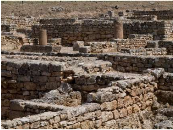
Uxama. Burgo de Osma, Soria

Near Ucero is the Park Interpretation Centre and, a few kilometres further on, you reach the hermitage of San Bartolomé, an emblematic place in the canyon from where the exceptional natural and geological values of the area are enhanced by the magical and exoteric content that the hermitage provides to the surroundings. From here you can appreciate the full extent of the greatness of this canyon of karstic origin. Its vertical limestone walls, nearly 200 metres high, have been modelled by erosive phenomena, giving rise to beautiful and capricious forms of relief. The archaeological remains of the Celtiberian-Roman city of Uxama correspond to the Roman city which, throughout the 1st century, reached an important level of development. At that time, the city was provided with an urban structure and important public buildings. At the end of the Empire, the city was walled in and its perimeter covered 28 hectares. The Castro hill stands out for its Islamic watchtower, a lookout tower, now conditioned as a viewpoint. It is the basic point from which to contemplate not only the ancient city, but also the surrounding landscape.