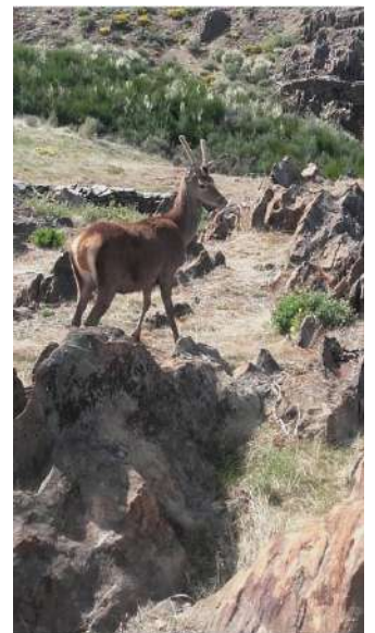
Ciervo en Puebla de Sanabria, Zamora

Remember, in Castilla y León, you'll find everything and more... WE CAN'T WAIT TO SEE YOU!!!