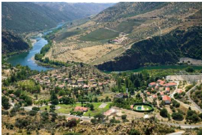
Mirador Arribes, Sucedle, Salamanca