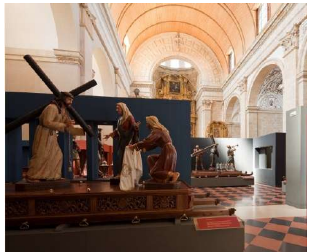
Museo Semana Santa, Medina de Rioseco, Valladolid

Medina de Rioseco, more commonly known as the city of admirals, boasts a rich artistic heritage that visitors can combine with the natural attractions. Its Easter museum is one of the best of its type, as evidenced by the quality of its carvings and its international recognition. It is also worth stopping at the San Francisco Museum of Sacred Art where you can see sculptures by Juan de Juni. In a special section we have the 15th-century church of Santa María de Mediavilla and its main altarpiece. The old sacristy contains the Benavente chapel, also known as the Sistine Chapel of Castile. For extra excitement on our trip, we have the wonderful work of engineering that is the Canal of Castile and the Antonio de Ulloa boat we can hop on to explore the peaceful waters. All of the above make this area on the doorstep of the Tierra de Campos region a place full of attractions to enjoy and visit.