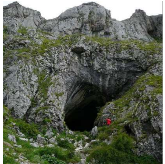
Cueva Fuente Cobre, Palencia

There are several routes for families with children in the Palentina Mountains. One such route is the Mazobre Waterfall trail, which is just perfect at this time of year as the winter ice melts in spring and the waterfall starts to flow. The route is a 6.6km round trip, of medium difficulty and is located between Cardaño de Abajo and Cardaño de Arriba. It follows a path that runs parallel to the Mazobre stream, the landscape is wonderful and the viewpoint is great for taking in the waterfall. Another recommended route is the Senda del Roblón, the route is 4km long, of low difficulty and starts in the town of Estalaya. The path takes us through fairy-tale forests to the hundred-year-old sessile oak tree known locally as "the grandfather". Finally, the Fuente Cobre is a 13km, medium difficulty route, with 400m elevation. This route leads us to the source of the Pisuerga river in the Cueva del Cobre. The route begins in Santa María de Redondo. Following the course of the river we enter the heart of the Redondo Valley, we pass through oak and beech forests to reach the Cueva del Cobre itself, where we see the waters of the Pisuerga River emerge.