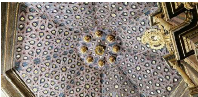
Presbiterio de la Iglesia de Santa Colomba de la Vega, León

The tour is structured around the Vía de la Plata, in the west of the province of León, and includes a total of thirteen Mudejar pieces. The tastes and customs of Al-Andalus adorn a time of coexistence between the Muslim and Hispanic worlds. We begin our tour with a visit to the "Carpentry of Armaz in the Vía de la Plata" exhibition in Valcabado del Páramo. This is an educational glimpse into the unique