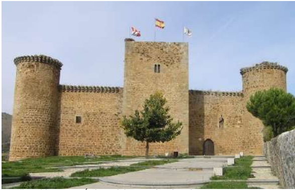
Castillo Valdecorneja, Ávila

In the beautiful town of El Barco de Ávila stands Valdecorneja Castle, perched majestically on a hill overlooking the valley and the river Tormes. It is named after the lordship of Valdecorneja and was owned by the House of Alba. Built on the site of a Vettones fortress destroyed by the Romans, it holds a wonderful position in the region. Its walls have witnessed many changes over the years. It is square with circular towers on the corners and sentry boxes in the middle of three of its walls, whilst the great keep occupies the centre of the fourth wall. The centre point of the castle was a parade ground that later became a cour d'honneur, where important guests were welcomed. Also worth noting is a well in the centre of the courtyard and a vaulted cistern dug out from the underground rock. Today the castle serves as a venue for various cultural and recreational events. You can round off your visit with a trip to the Clock House and the old Jail, which are just two of the many other local places of interest.