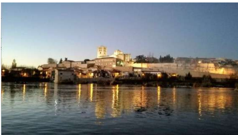
Vista desde Los Pelambres, Zamora

Zamora offers beautiful free guided bird-watching walks in the natural surroundings close to the city of Zamora, in the Riberas del Duero region, which is home to a great deal of biodiversity, with 178 catalogued species of birds and the Valorio Urban Forest. Among the birds to be spotted are the populations of Herons, raptors, kingfishers, cormorants, storks and there are also turtles in the river. The routes last 3-4 hours and are led by specialist guides. High-end telescopes. Teaching materials. Accident and liability insurance. Reservation required.