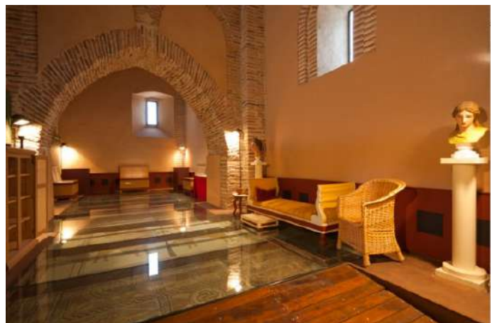
Aula Arqueologica Villa De Santa Lucia, Aguilafuente, Segovia