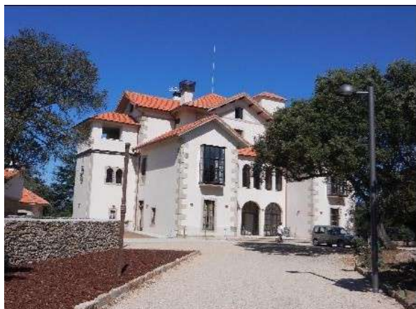
Posada Real El Cuartón de Inés Luna, Traguntia, Salamanca