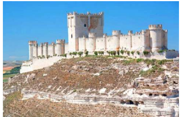
Castillo de Peñafiel, Valladolid

The riverbank of Duero Vallisoletana constitutes an indisputable reference point and a gateway to extensive and varied wine culture and artistic historical heritage. The capital of the area, Peñafiel, is located on the banks of the Duero river, which is dotted with countless wineries in which you can taste the best Ribera de Duero wines. The castle of Peñafiel, shaped like a ship, stands on a hillock. Its figure presides over the town and from its vantage point you can see the basins of the Duero and Duratón rivers. Its current appearance dates back to the second half of the 15th century. The castle was declared a historical-artistic monument in 1917 and houses the provincial wine museum. A short distance from the imposing castle is the old bullring square, El Corro. The square is bordered by 48 buildings and was created to hold bullfighting festivities. It is unique as a result of the buildings' wooden decorative facades. Another must-see is the church -convent of San Pablo, built by the young Juan Manuel in Gothic-mudéjar style, taking advantage of the fortress built by Alfonso X the Wise. Peñafiel is therefore a must-see not just for wine lovers, but also for anyone who wants to discover an important part of Spain's historical legacy.