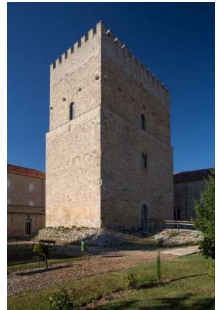
Torreón de los Guzmanes, Caleruega, Burgos