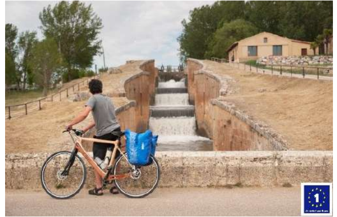
Fromista, Canal de Castilla, Palencia