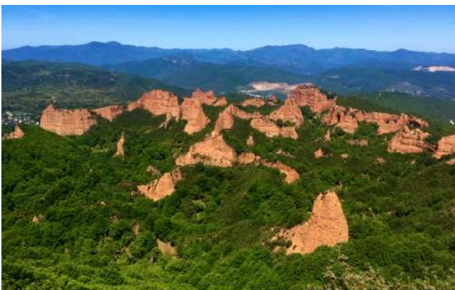
Las Medulas, León

This month, we invite you to discover the province of León's mining basins route (Ruta de las Cuencas Mineras). In addition to its extensive historical and natural heritage, this territory is unique thanks to previous mining activity that transformed the landscape, creating heritage elements of great value. Museums such as the Railway Museums in Cistierna and Ponferrada, the Castilla y León Steel and Mining Museum in Sabero and the National Energy Museum in Ponferrada showcase just some of the examples of this rich industrial heritage. You can learn about how coal mining developed in Fabero from its protagonists in the Pozo Julia Mine. Your visit would be incomplete without learning about the gold extraction process, 'ruina montium', in the mines of La Leitosa and los Cáscaros or in Las Médulas. Likewise, cyclists can explore a variety of all-terrain routes through the mining basins, while the La Robla mining train can take you to incredible places. And, of course, you can enjoy a rich and varied cuisine in each of the areas that you visit.