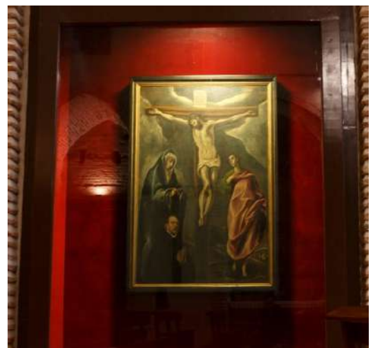
Cuadro de El Greco, Martín Muñoz de las Posadas, Segovia