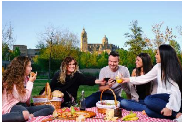
Lunes de Aguas