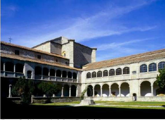
Claustro Real Monasterio de Santo Tomás, Ávila

The Royal Monastery of Santo Tomás is of incalculable value. It was founded thanks to Hernán Núñez Arnalte, the Catholic Monarchs' treasurer. It has been greatly significant throughout its history; the monastery was previously a royal palace and a headquarters for the General Study of Theology and Arts. The creation of the latter was sponsored by the Catholic Queen (Isabella I) and was constituted as a public university under the reign of Philip II. The distinguished students who graduated from this university include Spanish statesman Gaspar Melchor de Jovellanos. The monastery is home to many treasures, including the tomb of Prince Juan (the Catholic Monarchs' only male child), the main altarpiece dedicated to Saint Thomas Aquinas (by Pedro Berruguete), the Christ of Saint Teresa (by Gil de Siloé), the choir and its three cloisters. It is home to a museum of oriental art and a museum of natural sciences.