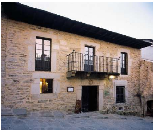
Posada La Cartería, Puebla de Sanabria, Zamora