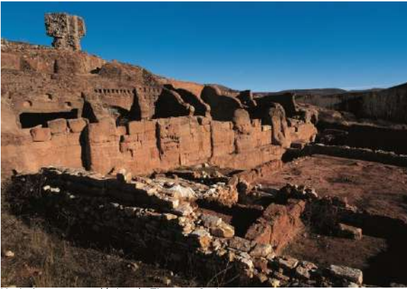
Yacimiento arqueológico de Tiermes, Soria