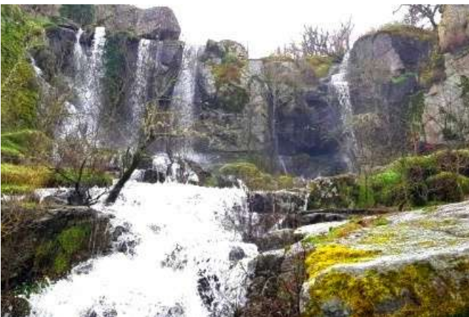
Cascadas de Abelón, Zamora