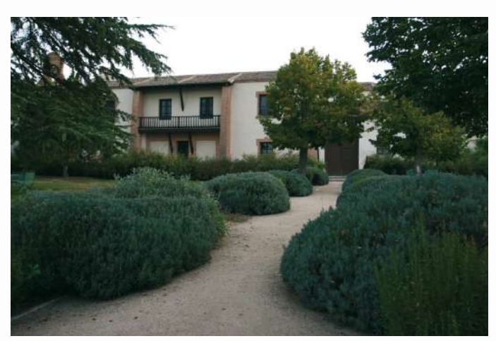
Posada Real Caserio de Lobones, Valverde del Majano, Segovia